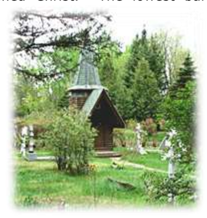
The Russian Orthodox Church in Exile resulted

slanted and symbolizes a brace for His feet. origin of this footboard is unknown, but in the symbolism of the Russian Church, the most common explanation is that it is the pointing upward Paradise for the Good Thief on Jesus' riaht and downward to Hell for the Thief on His left.