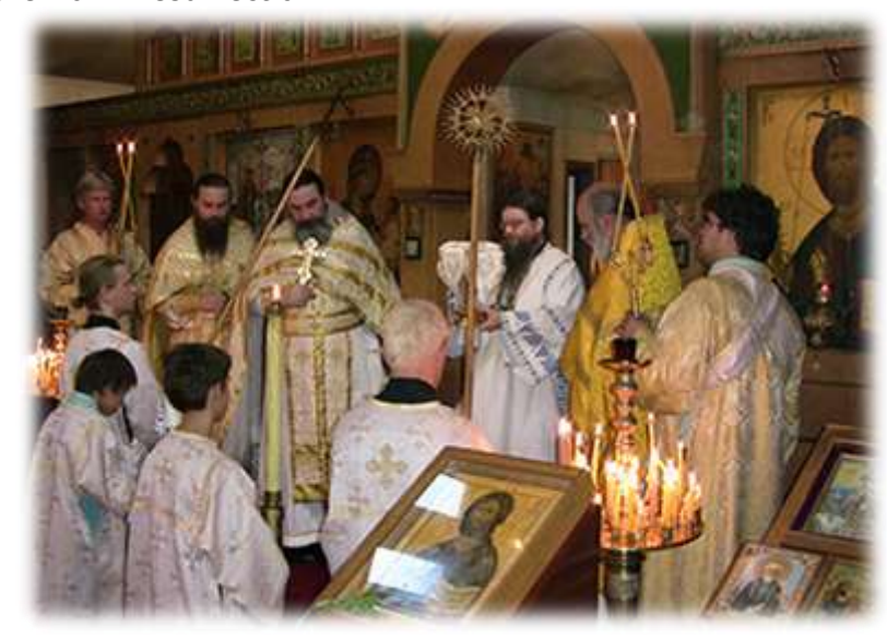
Holy Transfiguration celebration - 2008

the transfiguration of Christ – which prepares Christians for their own resurrection.