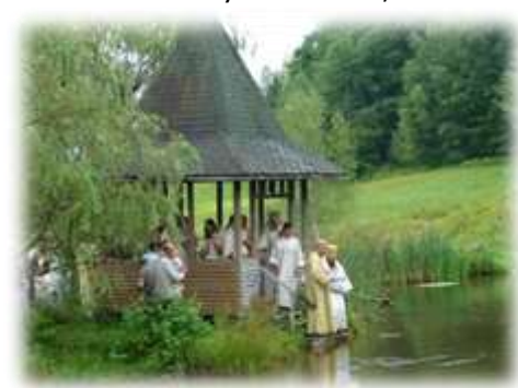
Celebration in 2010

from a split with the Russian Orthodox Church Outside of Russia, in 2001. The former prelate of this Church, His Beatitude Vitaly Oustinov, then retired, headed the opposition