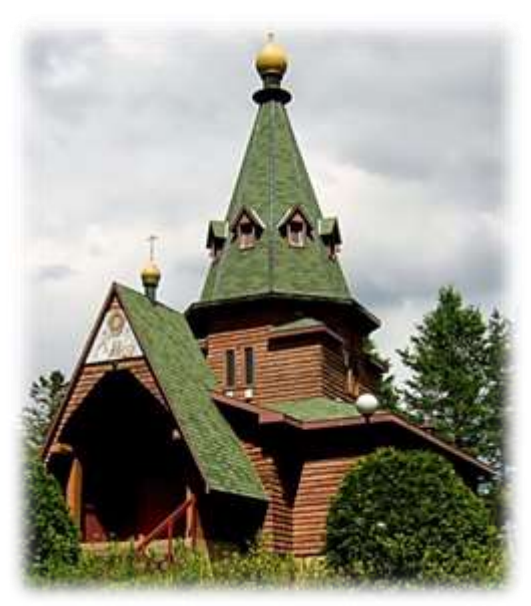
Holy Transfiguration Monastary