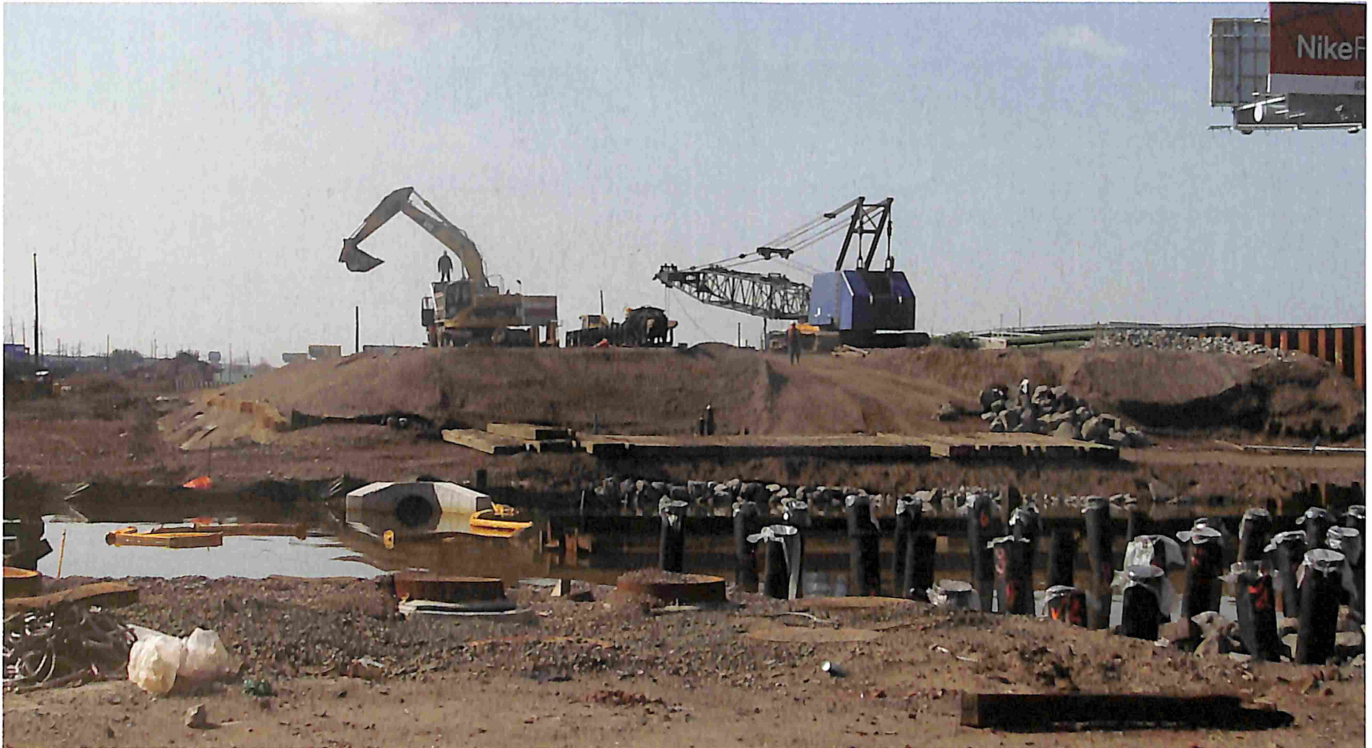
Crews at work preparing for new track near the port.

tracks and a footprint that would allow for simultaneous train operation to and from the north and the west.