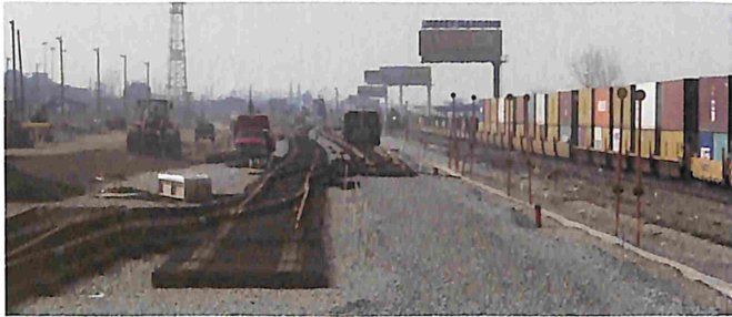
The Lehigh Line has been double-tracked.

Railroad operations have been thriving in northern New Jersey for well over 150 years. Fallen flags like Lehigh Valley, Reading, and Pennsylvania Railroad all built lines into the area, all for different purposes in a different era. Now, a series of six engineering projects worth more than $70 million is melding those lines