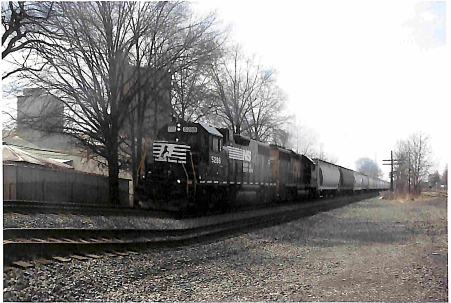
Conrail Shared Assets freight rolls over the recently double-tracked former Lehigh Valley Line near Bound Brook, N.J., powered by a locomotive from each of its parent companies.

For several reasons, Conrail could not build these projects in a linear fashion. As a large amount of the track