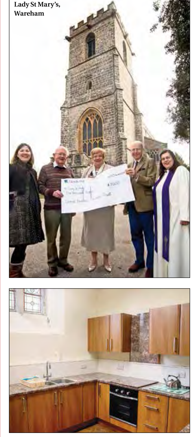
New kitchen at St Mary's, Winterborne Stickland

Churches in Bournemouth do not currently qualify for grants from DHCT as a recent defining deed approved by the Charity Commission limits beneficiaries of the Trust to churches that lie within the administrative area of Dorset.