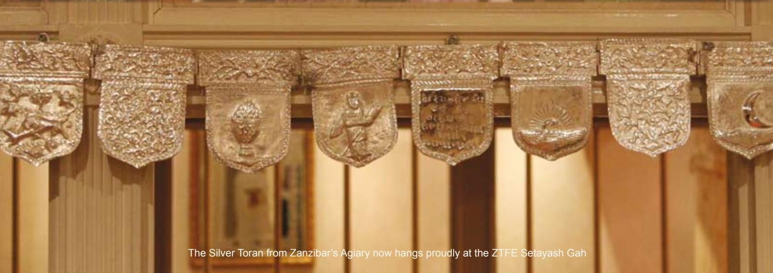
The Silver Toran from Zanzibar's Agiary now hangs proudly at the ZTFE Setayash Gah