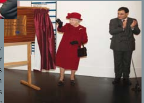
Lord Bilimoria looks on whilst the Queen unveils the plaque

Both Lord Bilimoria and Chef Cyrus Todiwala were at the opening by the Queen of Thames Valley University's award winning building, Paragon House. Lord Bilimoria is