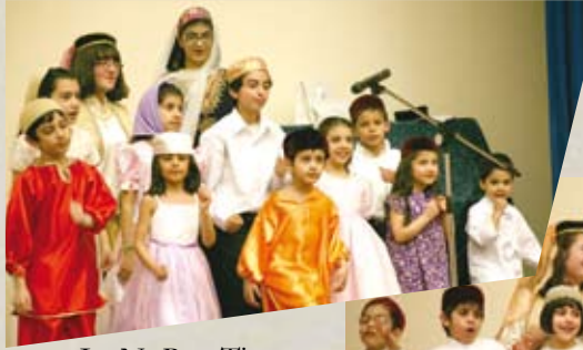
Its NoRuz Time being performed

Hello fellow Zoroastrians. The Extra Young Zoroastrian's (XYZ) would like to share with you their achievements in the lead up to Jamsheedi NoRuz 2009.