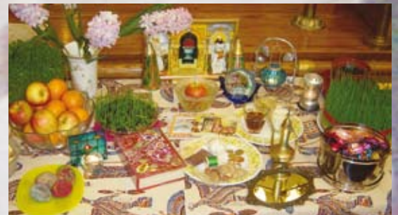
The Haftsheen Table

Overall, these past few months have been an exciting and busy time for the XYZs. Planning for this event has truly been a team effort! We thank all