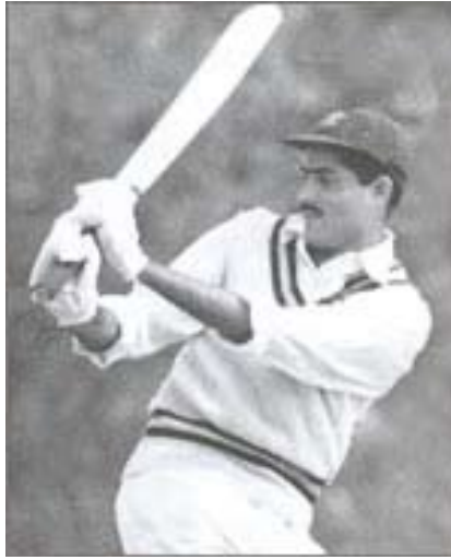
Cricket legend Nari Contractor playing in the 1959 test between India and Australia

On Sunday, 5 April 2009, ZTFE hosted a function in honour of Nari Contractor, one of the most illustrious among