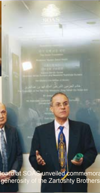
Donor Board at SOAS unveiled commemorating the generosity of the Zartoshty Brothers