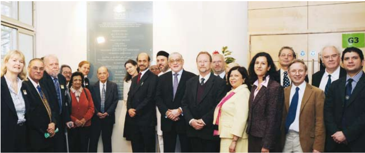
The SOAS Plaque with members of ZTFE and SOAS communities