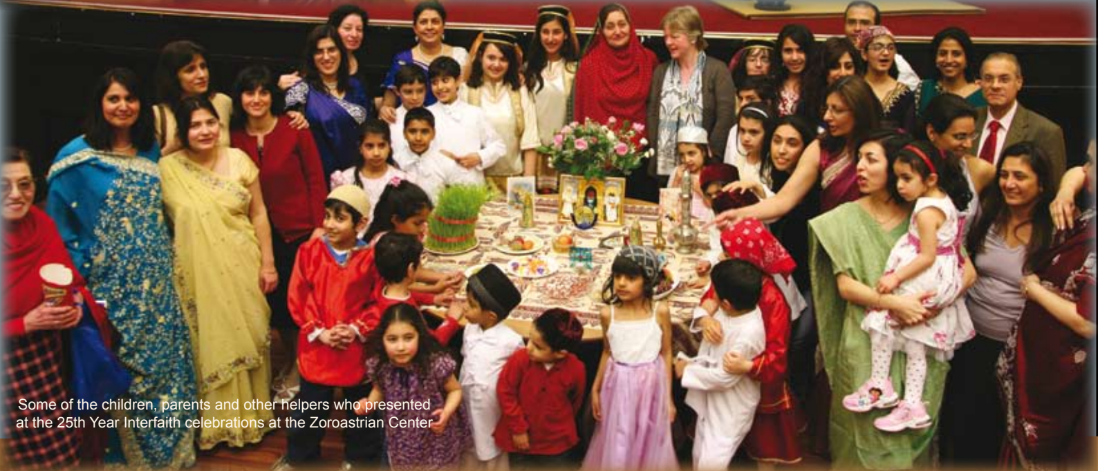
Some of the children, parents and other helpers who presented at the 25th Year Interfaith celebrations at the Zoroastrian Center