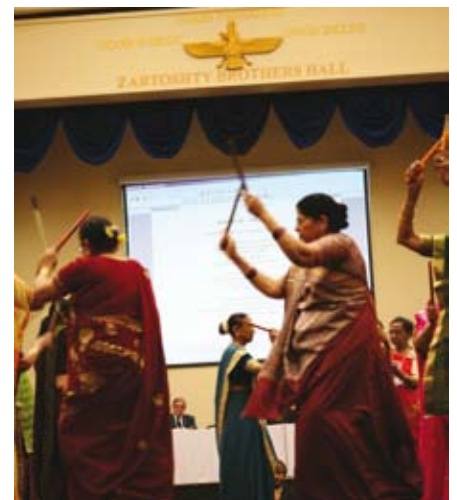
One of the dance groups at the celebration