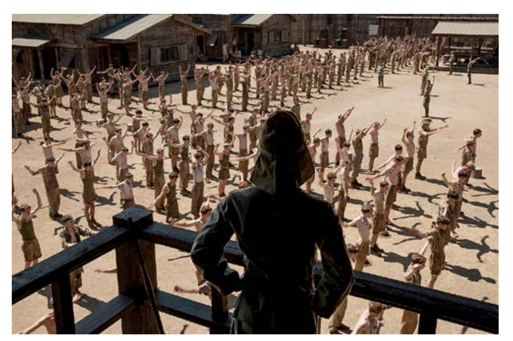
The Bird (MIYAVI) looks out over his prisoners at Omori.