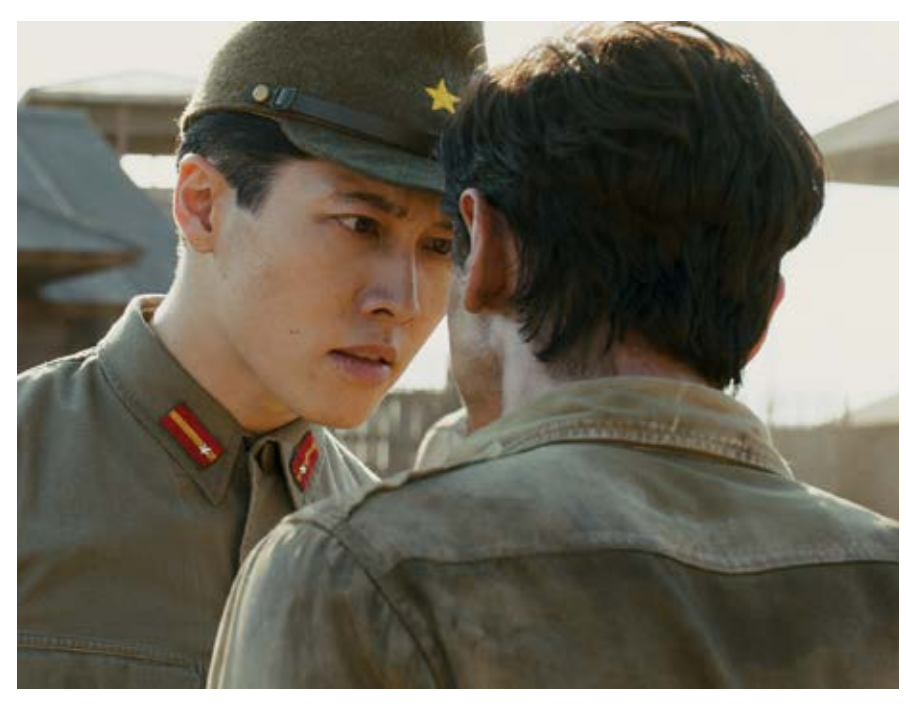
The Bird torments Louie.

From his always extraordinary eye on the most thought-provoking dramas, to epics and comedies both light and dark, director of photography Roger Deakins' work is embedded in the features of all the great directors with whom he's partnered. The breadth and