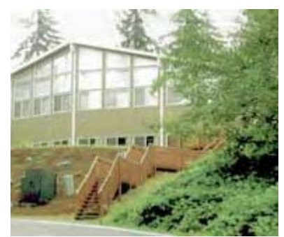
Camp Berachah Ministries

ADDRESS: 19830 SE 328th Place, Auburn, WA 98092