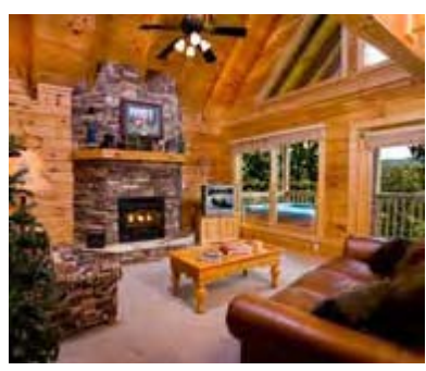
Cozy Bear Cabins

<u>www.tripadvisor.com/Hotel_Review-g55184-d2100740-Reviews-Chilhowee_Mountain_Retreat-Maryville_Tennessee.htmltripadvisor.com</u>; and Google Maps where you enter 865-983-8511.