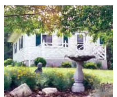
Bethany House Ministries (Meadows of Dan, Virginia)

CONTACT ADDRESS: P.O. Box 14853, Greensboro, NC 27415