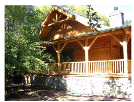
The Brook Lomond Cabin

An outreach of the Southern California District, Pinecrest is a year-round facility addressing the needs of our ministerial families. Pinecrest has three large two-story Alpine lodges. The lodges have individual rooms that contain one queen bed and three single beds in a bunk bed configuration.