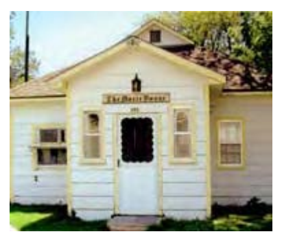
The Marie House

ADDRESS: 202 Broadway, Naponee, NE 68960