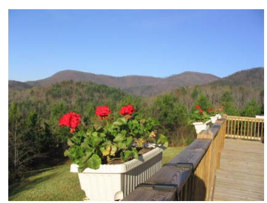
Shepherd's Refuge – Selah Ministries

Restoration Road is for those in Christian service who have need of renewal, strength, and encouragement. Nestled in the mountains of Georgia and surrounded by God's own creation, Restoration Road provides an atmosphere where you can experience afresh His wonderful presence. Take long walks in the woods, or sit on the porch and enjoy the country air and the music of the quiet nights. Visit the quaint towns and have fun in their shops. Above all, bask in God's love for you and be restored. Our three cottages are completely furnished and equipped with a full kitchen and laundry. Children love to roam our safe, 12-acre campus.