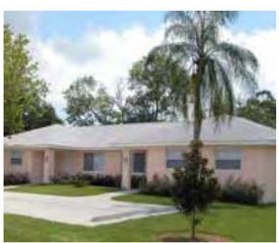
D&D Missionary Homes, Inc.

Beside Still Waters is a program that wishes to bless Gods servants from all areas of the globe, by providing a place of rest and refocus. This program is not provided to give a free vacation. It is intended for those who are in spiritual need of refreshment in the Lord and who are seeking God's direction. We define a servant as an experienced pastor, minister, missionary, bishop, priest or rabbi, etc. (Applicant must have three years or more of full-time service in good standing.) We are not open to church staff or support staff. The townhouses we provide are located on Anna Maria Island, Florida, approximately one block from the beach. Application is located on our blog along with current availability. The program costs range from $150 - $250. At this time, maximum stay is 10 days (January-August), or 14 days (September-December). Program not open to groups. Children are welcome. Maximum number of guests is 6 per unit. One unit per booking. We can no longer do two units for more than 6 guests. Please note: 501(c)3 IRS (aka: US Treasury) paperwork for your church is required. This is not your state tax exempt documentation. Please see website for more information on the program requirements.