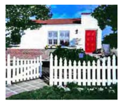
The Cottage on Coronado Island

Amenities include : Breakfast, afternoon hors d'oeuvres, hairdryer, bathrobes, iron & ironing board, CD/Tape player, piano, extensive library, DVD player, wide screen TV, internet access, and complimentary concierge services. Outside: Seating throughout the property, horse shoes, and a fire pit. For a fee we can provide an airport shuttle.