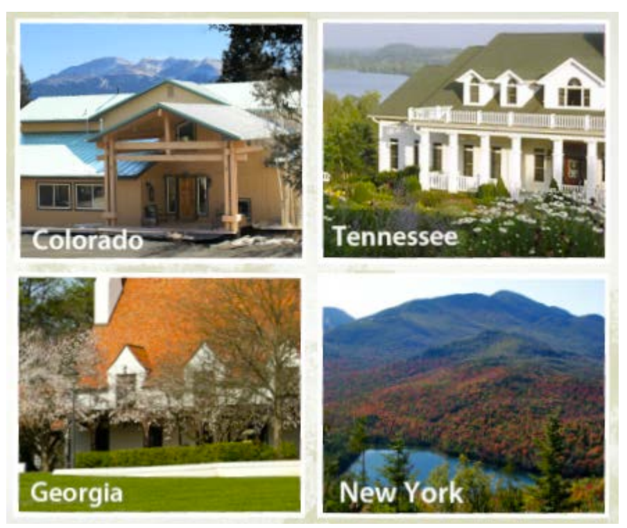
SonScape Retreats Retreats in Colorado and Tennessee Off-sites in Upstate New York and Georgia