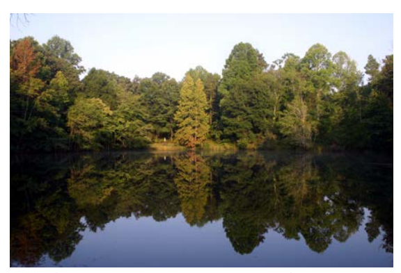
Healing Springs Retreat Center

ADDRESS: 83 College Heights Rd, PO Box 153, Franklin Springs, GA 30639