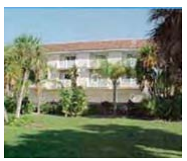
Beside Still Waters

ADDRESS: Taylor Family Foundation, Inc., 1111 9th Ave W, Suite E, Bradenton, FL 34205