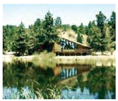
Pinecrest Christian Conference Center

Missionaries to Ministers is a ministry aimed at helping the minister and his or her family in the areas of pornography, sexual addiction, boundaries, and relational issues. We help to create a restoration process that is productive, lasting, and fruitful and speak from our own experiences and recovery. Individual and couple's counseling is provided in person, via phone, or virtual (iChat, Skype) sessions. M2M is available to educate pastors and churches on these very important and relevant issues.