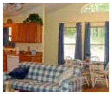
Brook at Bethpage

Anchor Retreat has fully-furnished two- and three-bedroom homes plus a one-bedroom apartment. Located on Table Rock Lake, 25 minutes from Branson, Missouri, and about 35 minutes from Eureka Springs, Arkansas and the great Passion Play. No pets please.