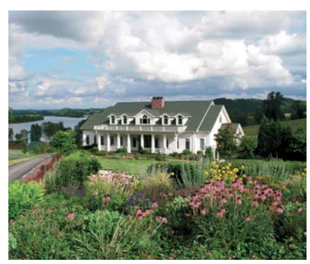
Whitestone Country Inn

Fairhaven Ministries is located in the beautiful Blue Ridge Mountains of Tennessee. Within easy driving distance are many activities—hiking, white-water rafting, horseback riding, swimming and boating, world famous Rhododendron gardens, antique shopping, and sightseeing. Please visit our website for more information.