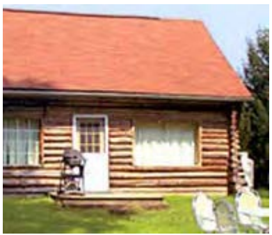
Mohican Valley Camp and Canoe

ADDRESS: 3069 State Route 3, Loudonville, OH 44842