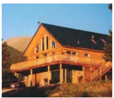
Shining Mountain Ranch

Private vacation homes on a ranch in Colorado are provided free of charge to full-time, evangelical Christian pastors and missionaries, and their families.