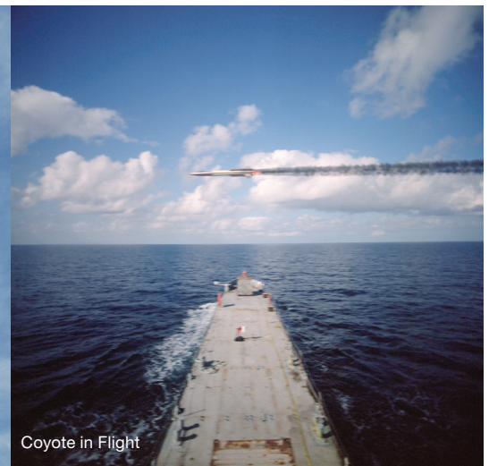
Coyote in Flight