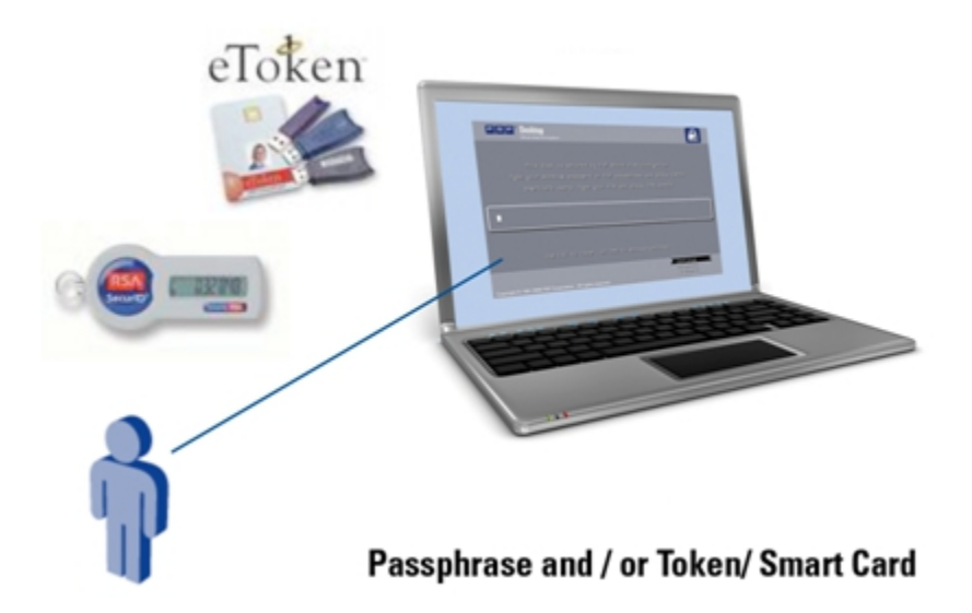
Figure 1: User authenticates with passphrase or smartcard/token

Whole Disk Encryption software also provides the ability to encrypt removable storage media such as USB drives. When you insert an encrypted USB drive into a computer system, it prompts for passphrase, and upon successful authentication, you can use the USB drive.