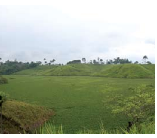
Picture: in some parts of the basin, the eichornia extension covers the entire water surface

The interviews made during the mission showed that this territory was divided into hundreds of small plots and little more than family-run farms (fincas). It was a very rugged area, with an endless series of hilly belts crossed in the middle by rivers Daule and Peripa. The construction of the dam blocked almost entirely the flow of both rivers, with major impacts downstream that have never been assessed. Upstream, on the other hand, the inundated area extending up to about 100 km north of the dam. At the sides of the main dam, there are some storage dams which already show worrying signs of decay. They were built to prevent the reservoir from expanding to lateral areas in a territory that is difficult to cross and that could stretch over 50 to 100 kilometres. The CAIC report claims that the reservoir forced 14,965 farmers from 8 villages of the flooded area out of their land while 63 communities were isolated. The Ecuadorian civil society organisations working in that territory assert that about 50,000 people have been directly or indirectly affected by the reservoir. After interviewing some of the people living in the