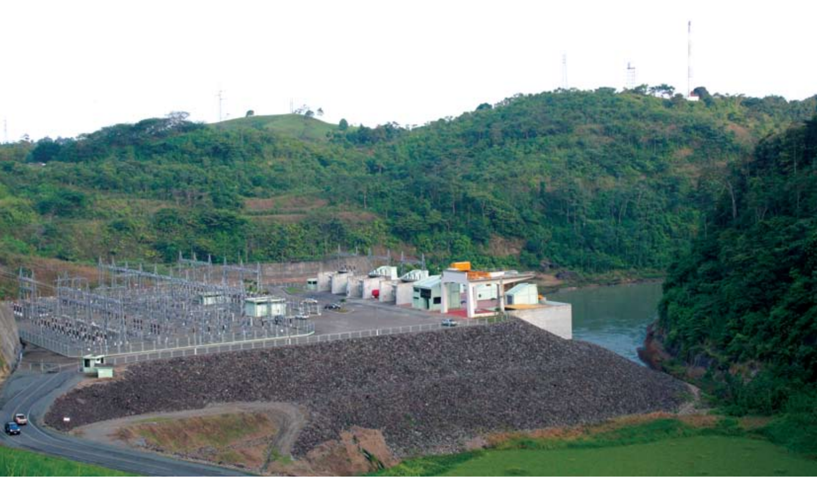
Picture: Marcel Laniado de Wind hydropower plant. View from the road on the Daule Peripa dam.