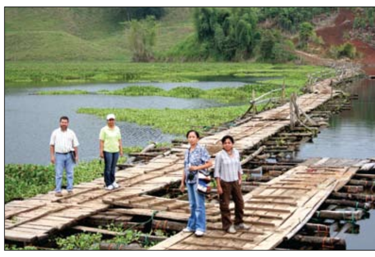
Picture: artisanal crossing bridge built by private individuals in the Manga del Cura territory

In the loan contracts, for example, one of the objectives included "irrigating 100,000 hectares; 50,000 along each bank of the Daule River". The report, on the contrary, remarks that "in reality only 17,000 hectares were irrigated" and that "other predicted benefits like boating, recreation and tourism never happened. In fact, the opposite occurred".