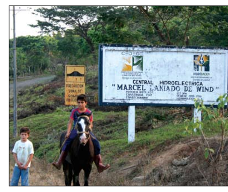
Picture: sign nearby the workers citadel set up for the construction of the Marcel Laniado de Wind hydropower plant

worsening Ecuador's economic situation and increasing its foreign debt without guaranteeing access to energy for the country's poorest population living in rural areas, beyond the reach of electricity supply networks.