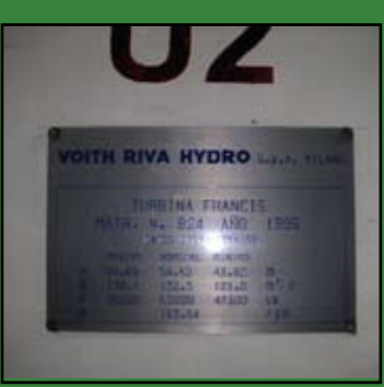
Picture: one of the three turbines installed in the Marcel Laniado de Wind hydropower plant.

It also appears that the actual power installed by Ansaldo does not match the agreed capacity. On 30th January 1996, less than two months after the financial agreement was signed between Mediocredito (on behalf of the Italian government) and the Ecuadorian government (22nd November