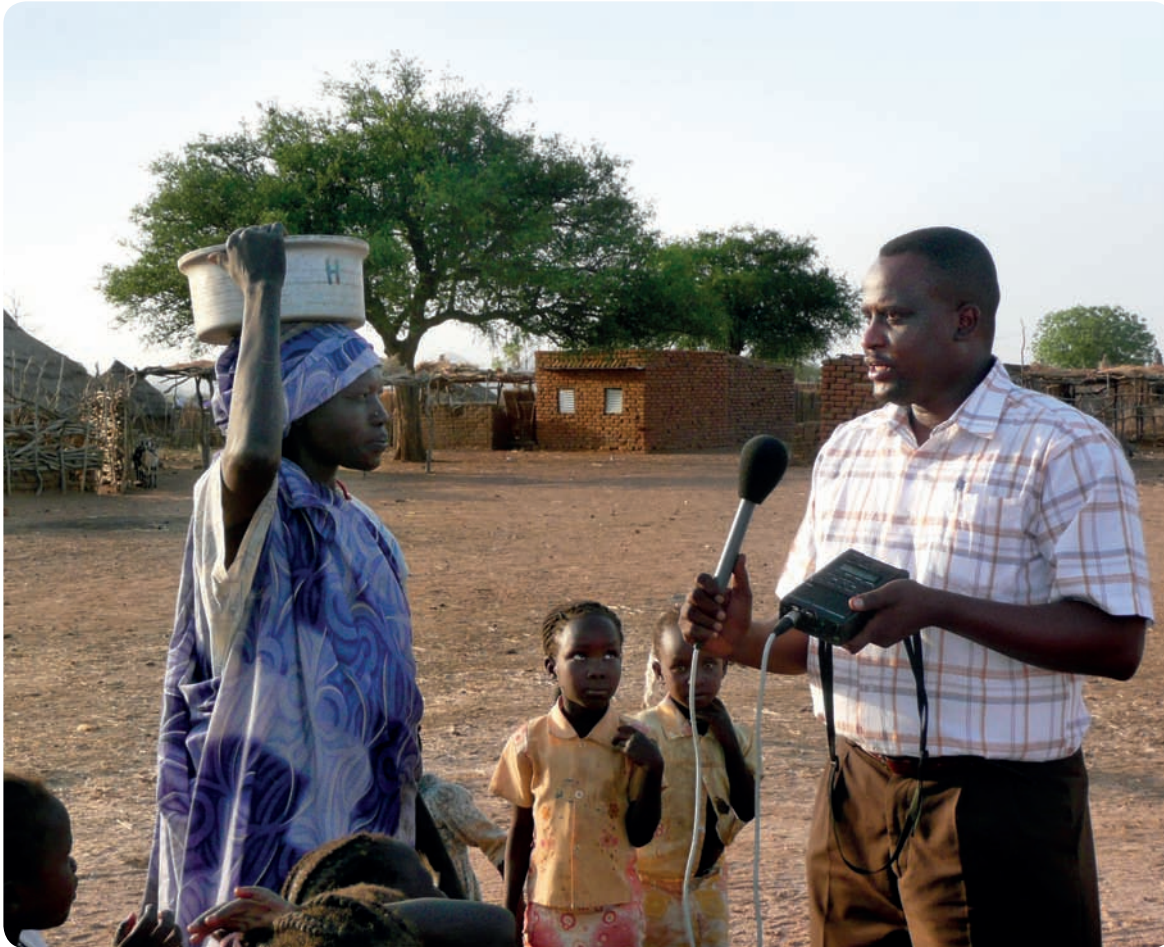
Left A journalist conducts an interview in rural South Kordofan, in the south of the country.