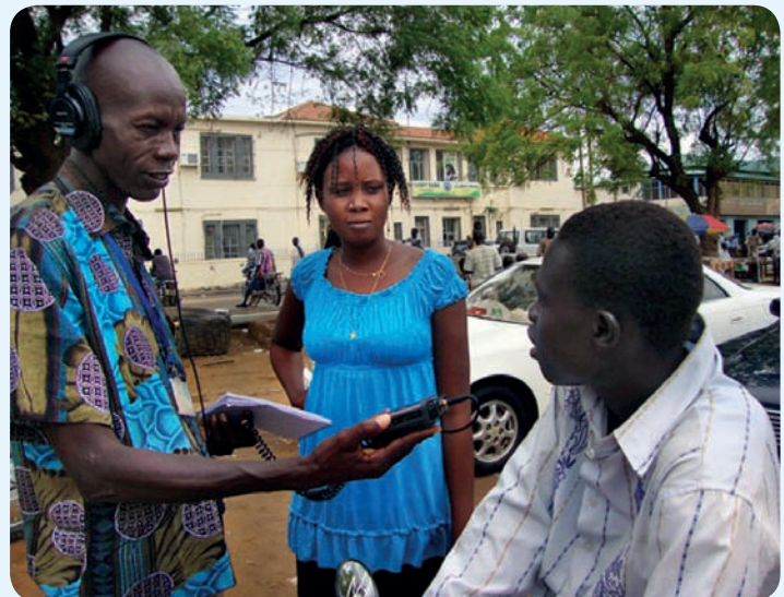
Above Trainee journalists in Juba practice using digital recorders.

Sources: BBC World Service research, 2007; BBC Media Action research, 2010; Bill Orme, 'Broadcasting in UN Blue: the unexamined past an uncertain future of peacekeeping radio', 2010; interviews conducted in Juba, May 2011