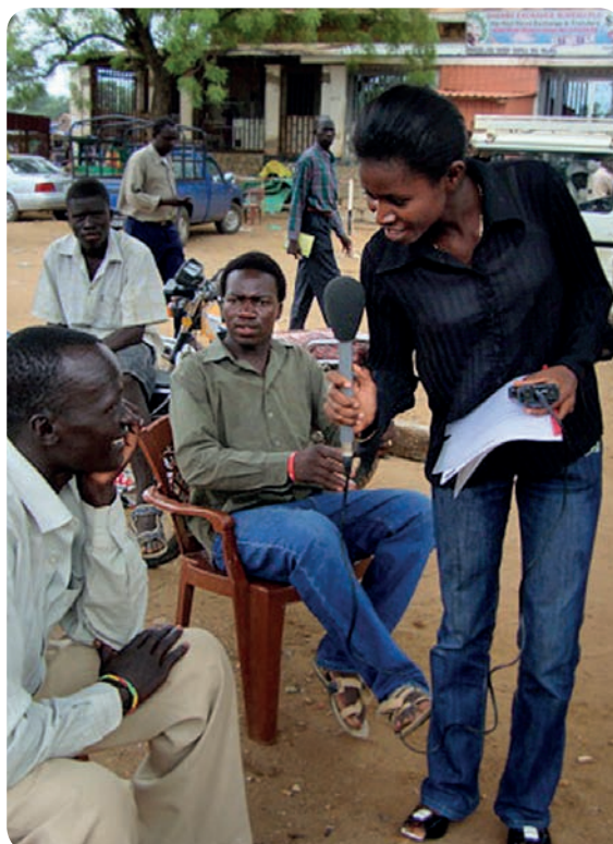
Right A trainee journalist hits the streets of Juba.

The National Democratic Institute (NDI) also conducts major focus group research biannually that, while not focusing specifically on media, provides a useful barometer of public opinion intended “to help policy-makers better understand the views of citizens as they make important decisions that will shape the future of the region”. 44 Radio Miraya undertakes annual audience research, though this tends to be limited in scope to meet the station’s requirement for reach figures and market analysis and the findings are not consistently published.