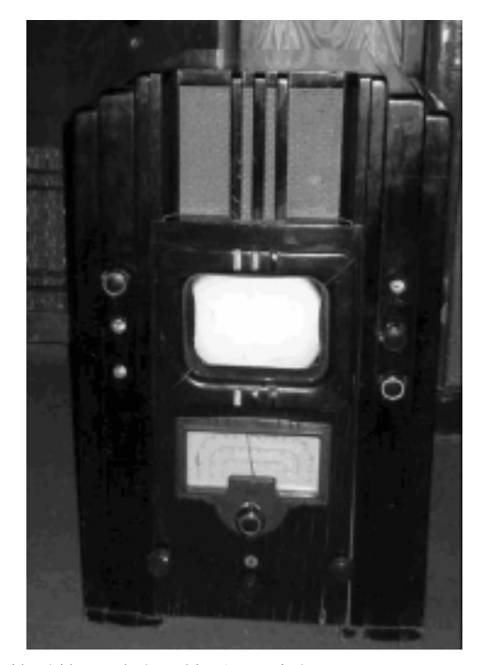
17TN-1 TV set designed by A. Raspletin

For the home television development history the 17TN-1 TV set is interesting since it is the first domestic desktop TV set of vertical design with electronic image scan. Just its early model is the country first TV receiver based on direct amplification scheme. In other words it is the forefather of most massive KVN-49 TV set and one of TV devices fully compliant to home radio industry requirements of the 40s beginning of XX age.