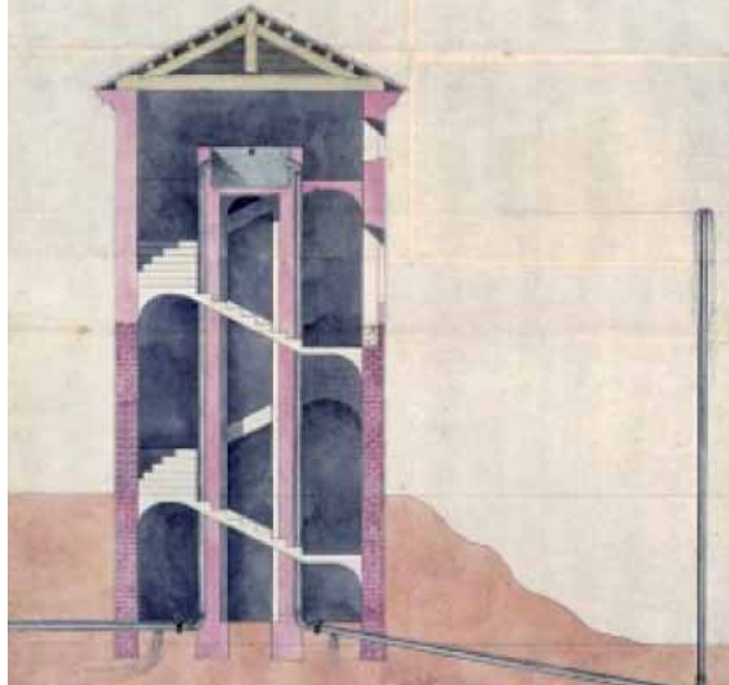
Fig.2 - On the left, a modern reconstruction drawing of the Fountains of the Ducal Garden of Colorno; on the right, a drawing of the hydraulic gimmick inside the tower probably used to pump in the water (conserved in Fondazione Cariparma)