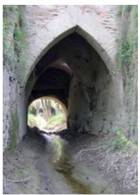
Fig.3 - On the left, south view of the Tower of Waters; the great ogival vault on the Galasso canal, which constitutes the foundation of the tower

dential building, thus confirming the intention of keeping the original structure while renovating and adapting the building to a new function.