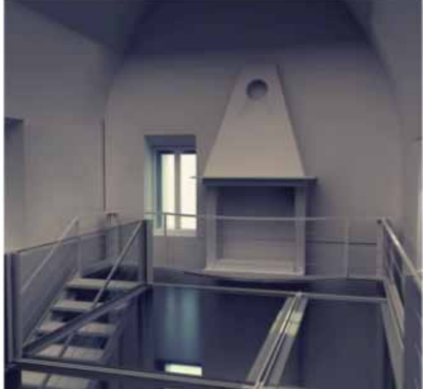
Fig.7 - On the left, the designed great cistern, repositioned at the extrados of the vault, after the restoration of the roof. On the right, some internal views, after the intervention, of the steel structure inserted in the unique original volume of the tower