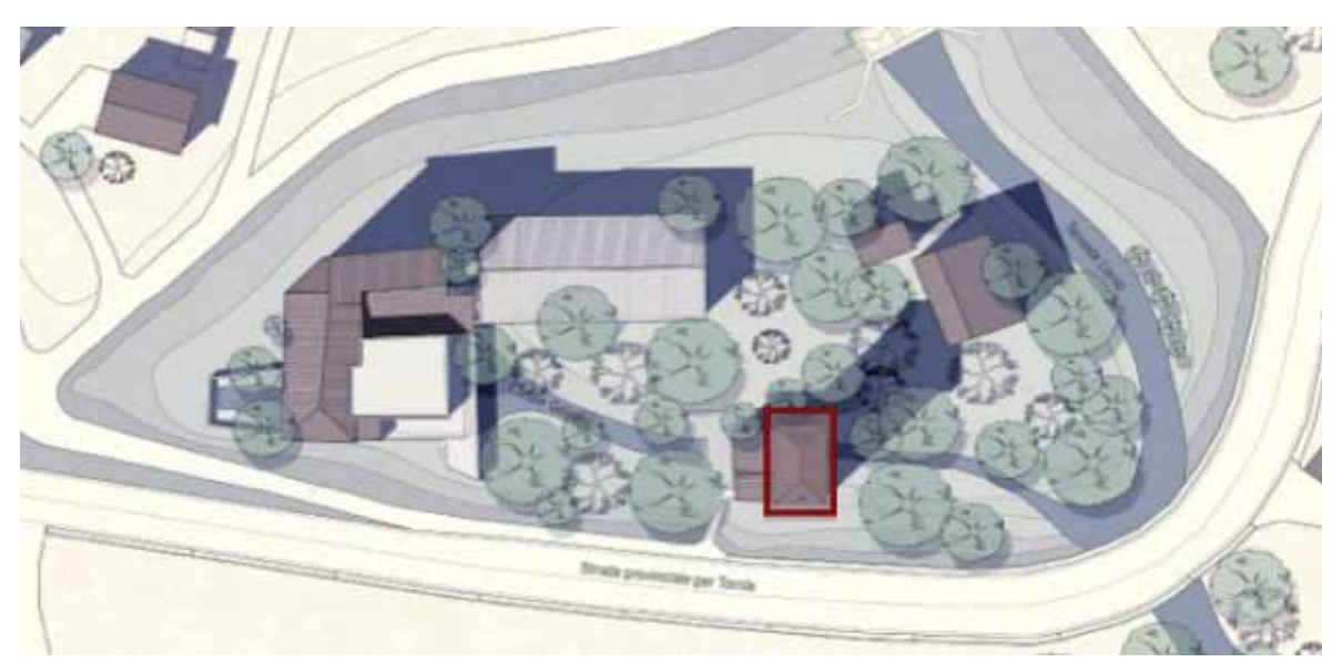
Fig.1 - The Tower of Colorno (in red) stays in a very strategic place, in the middle of an area devoted to water, at the hydraulic node of the junction between the Lorno River, the Parma River and the Galasso Canal

Thus, in order to fully understand the value of this monument, it is fundamental to consider its historical and hydraulic features, also clarifying the complex system of water and the surrounding countryside. For this reason, the study has been articulated on different and parallel fronts of investigation, always dialoguing each other. In the first phase, an historical research was made on the original maps and on some still unedited iconographic sources, in order to define, through a comparative method, the transformations of the territory around the tower and the possible system of alimentation of the garden fountains (Fig.2, left). Secondly, the role of water into the tower was highlighted by a critical comparison between the findings of a precise architectural survey and some ancient drawings on "water machines", obtained from coeval treatises (as Belidor, 1700). This approach made it possible to reconstruct the most probable mechanism used inside the tower before its conversion into a residential building, at the middle of 20th century (Fig.2, right).