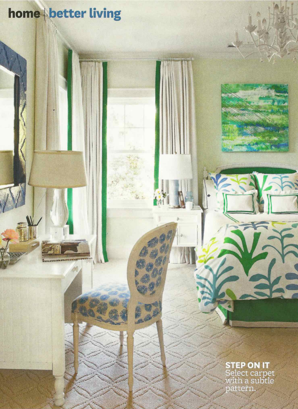
STEP ON IT Select carpet with a subtle pattern.