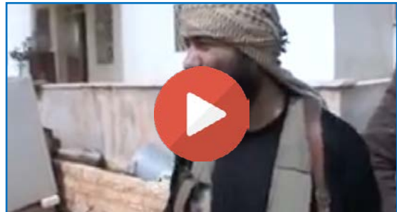
Video footage showing three dead bodies with signs of torture on it

Hezbollah militias executed five people where the residents found their dead bodies tossed in the street. We found out later that they were rebels that were arrested by Hezbollah militias.