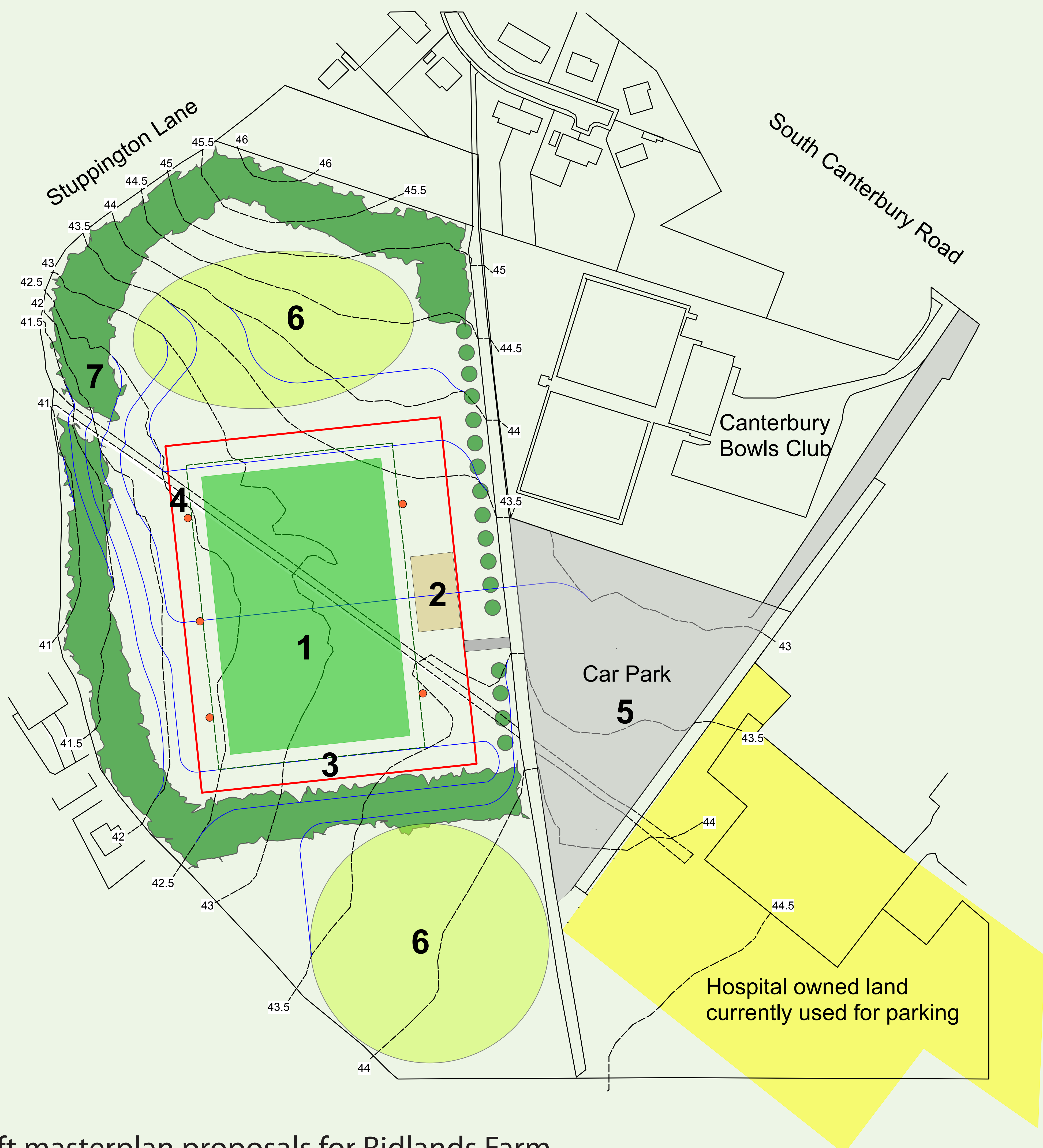
Draft masterplan proposals for Ridlands Farm