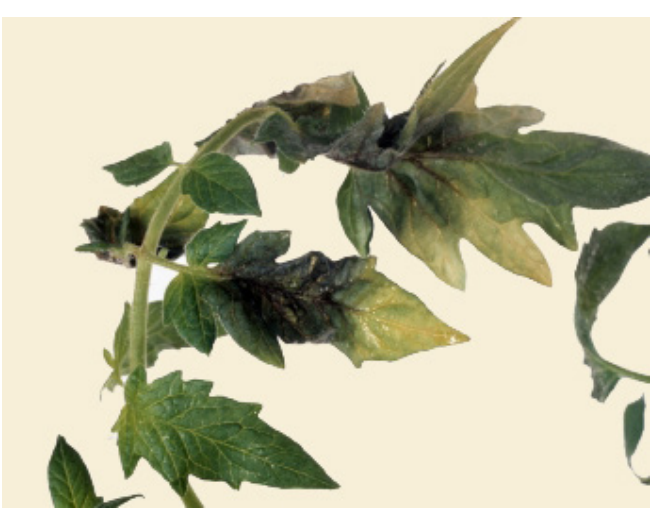
Late blight lesion on tomato leaf.