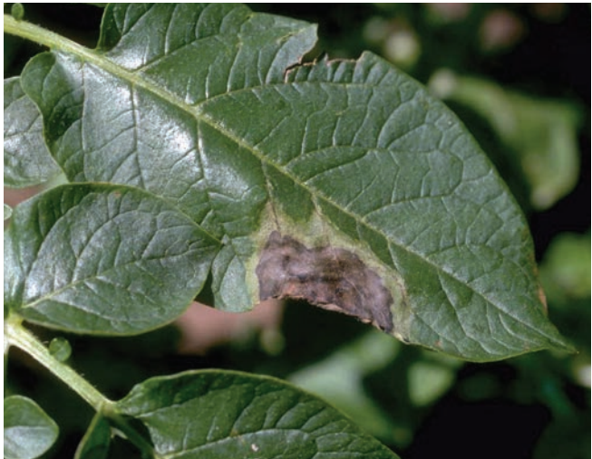
Late blight lesion on potato leaf.