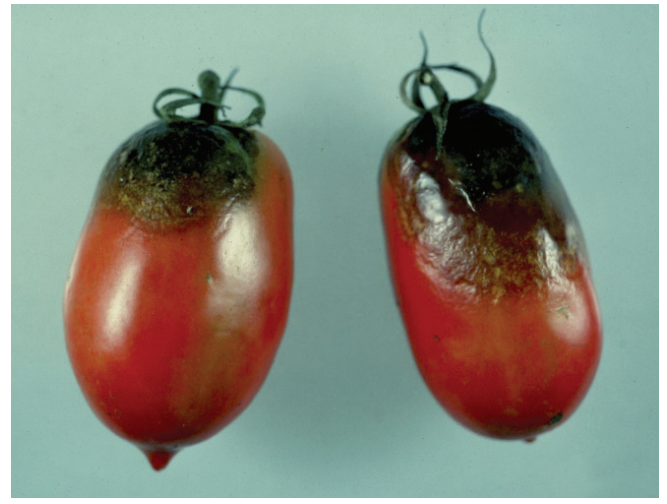
Late blight disease on tomatoes.

If possible use a system of irrigation (such as drip) that will keep the foliage dry. Late blight cannot develop if leaves are dry and humidity is low. If ample garden space is available, space potato plants further apart to increase air circulation around plants. This will help to minimize periods of leaf wetness and reduce chances of late blight infection.