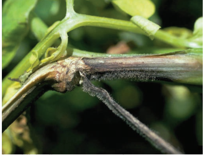
Late blight disease on potato vine.