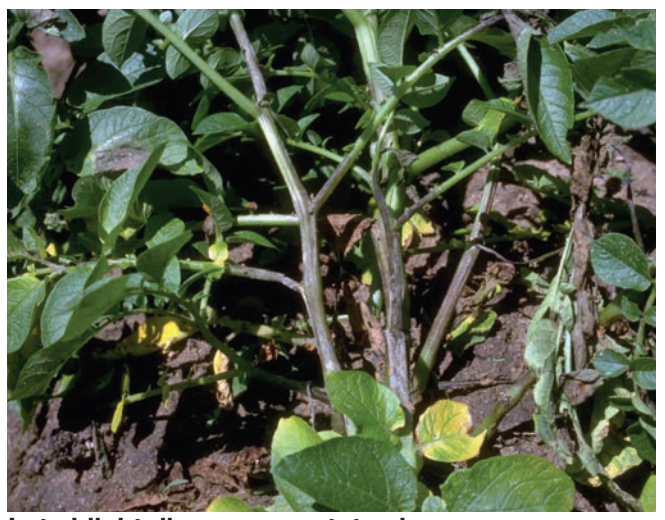
Late blight disease on potato vines.