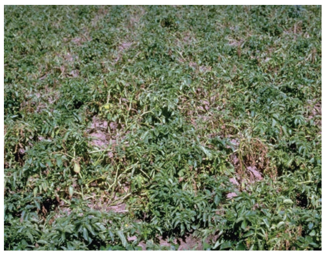
Potato field infected with late blight disease.