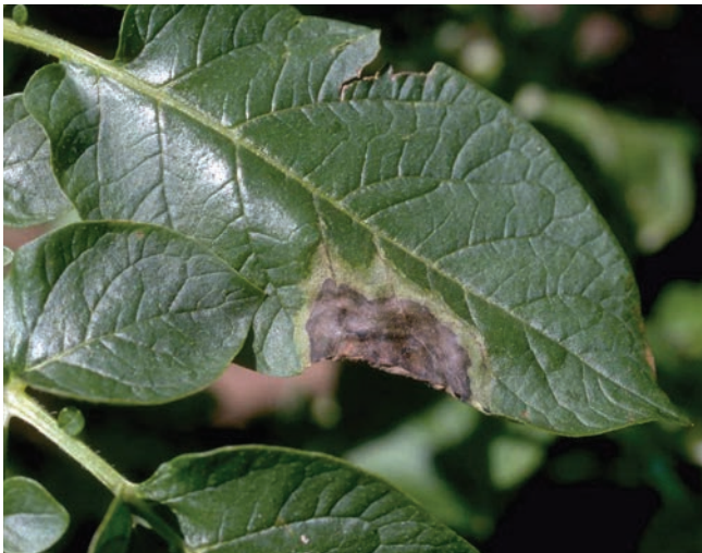
Late blight lesion on potato leaf.