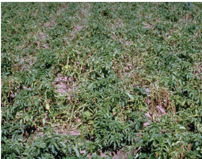
Potato field infected with late blight disease.