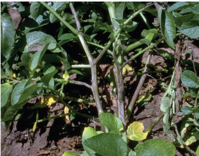
Late blight disease on potato vines.