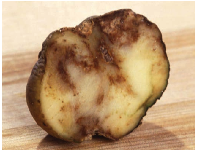
Cross section of potato infected with late blight.