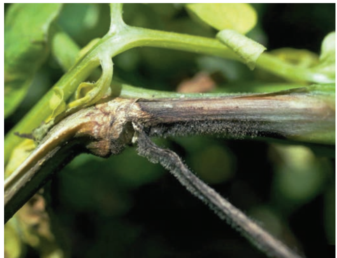
Late blight disease on potato vine.