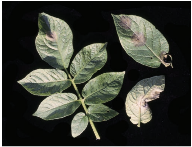
Late blight lesions on potato leaves.