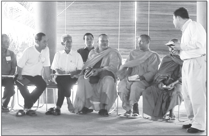
"Living with Heritage" community meeting, June, 2006.

The director general responded by creating the Interpretation Advisory Committee. This was the first-ever working committee on interpretation at Angkor, bringing together an unprecedented group of department