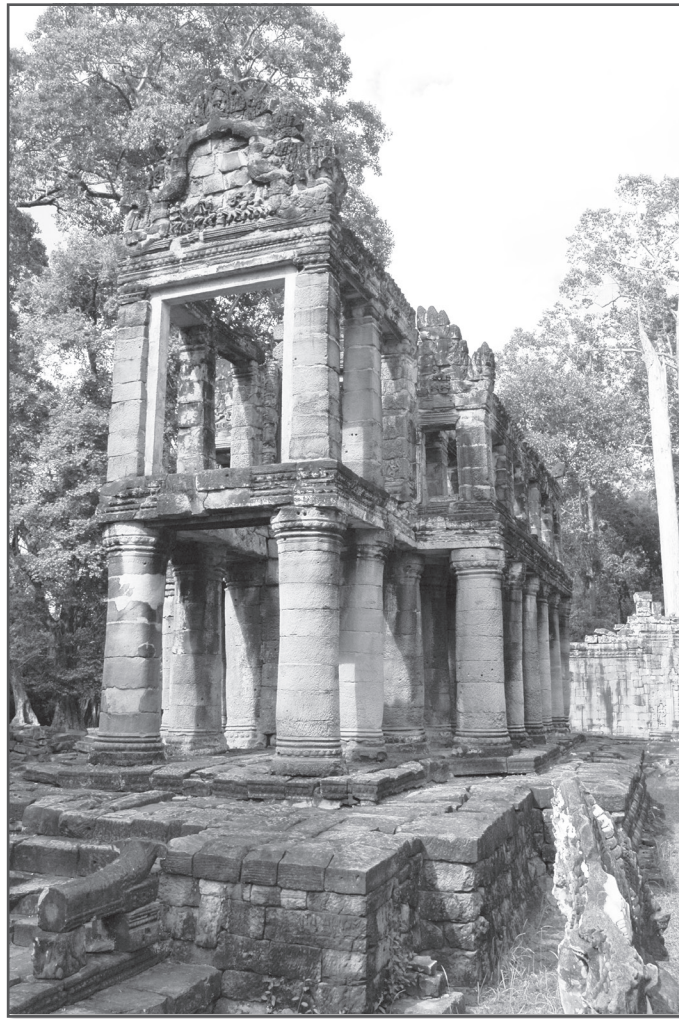
The two-story pavilion, Preah Khan.

We did not have quick solutions, but we did have a way to approach the challenges—one that began, as Ricky Wurman might have said, with understanding what is not yet understood.