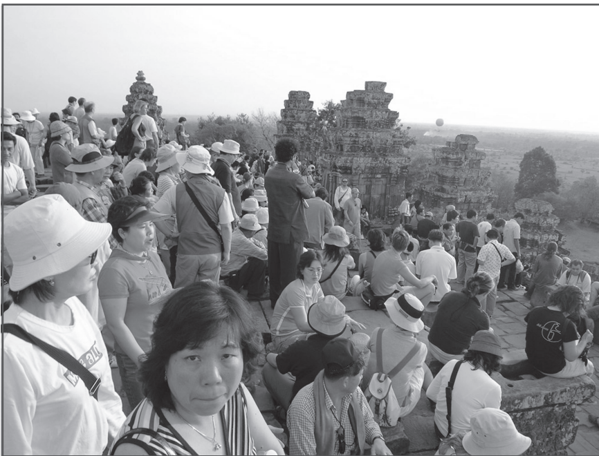
Crowds atop Phnom Bakheng await the sunset.

Preah Khan, our next WMF site, was a case in point. The 138-acre complex, about one-third the size of Central Park, was built in the late twelfth century by King Jayavarman VII, who ruled Angkor at the height of its grandeur. Preah Khan was a walled city with thousands of inhabitants working to support a Buddhist temple at the center of the complex. To conservationists, Preah Khan officially has been preserved as a “partial ruin,” but in reality Preah Khan and the adjacent neighborhoods are active places. Our plan was to replace the dim and dusty visitor center at Preah Khan with an updated space that presents the site’s story with greater historical depth and contemporary context. Most important was a collaboration with our Cambodian colleagues to facilitate a model process and plan for the future interpretive centers within the park.