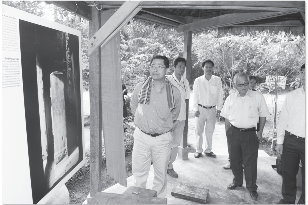
The opening of the Preah Khan Visitor Center, December 2008.