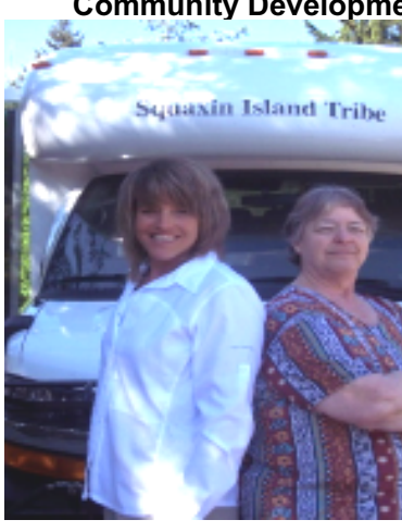
A Free Public Transit Service Squaxin Island Tribe

Squaxin Island Tribe Department of Planning Community Developme