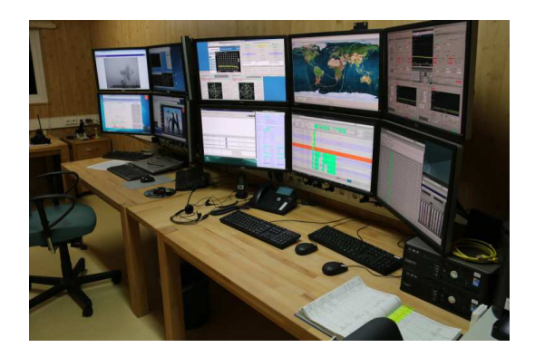
Fig. 3 The new control room with the operator desk for VLBI work of the BKG and satellite tracking of the DLR.

The operator room is jointly used by DLR and BKG. The goal is to extend the autonomous and remote operability of the site to enable the requirements for more observation sessions over the whole year. It is a key feature to extend the operation periods in GARS O'Higgins without increasing the presence of staff on site.