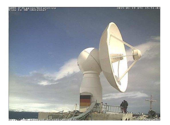
Fig. 1 The Webcam image of the VLBI antenna.

tal Accurate Clock (TAC), offering time and frequency.