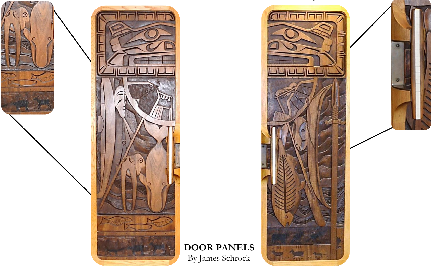
DOOR PANELS By James Schrock

The handles are made of rosewood and fossilized walrus ivory.