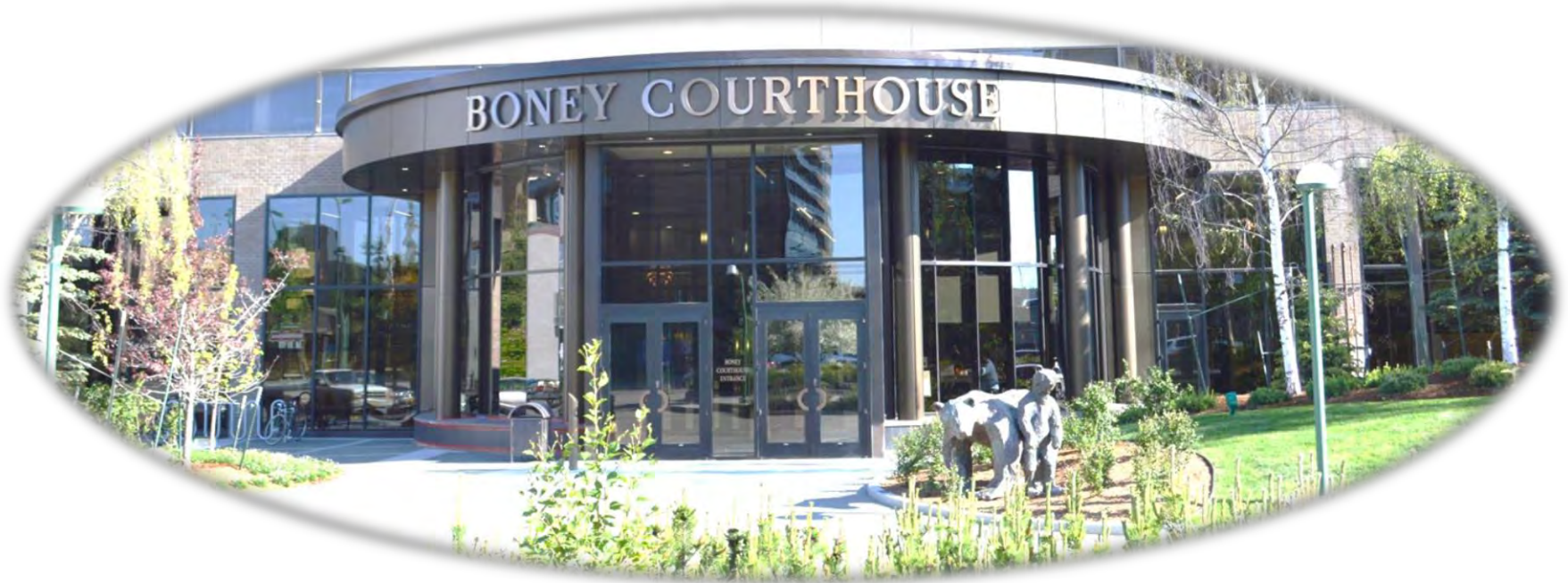
Boney Courthouse Main Entry – 2015