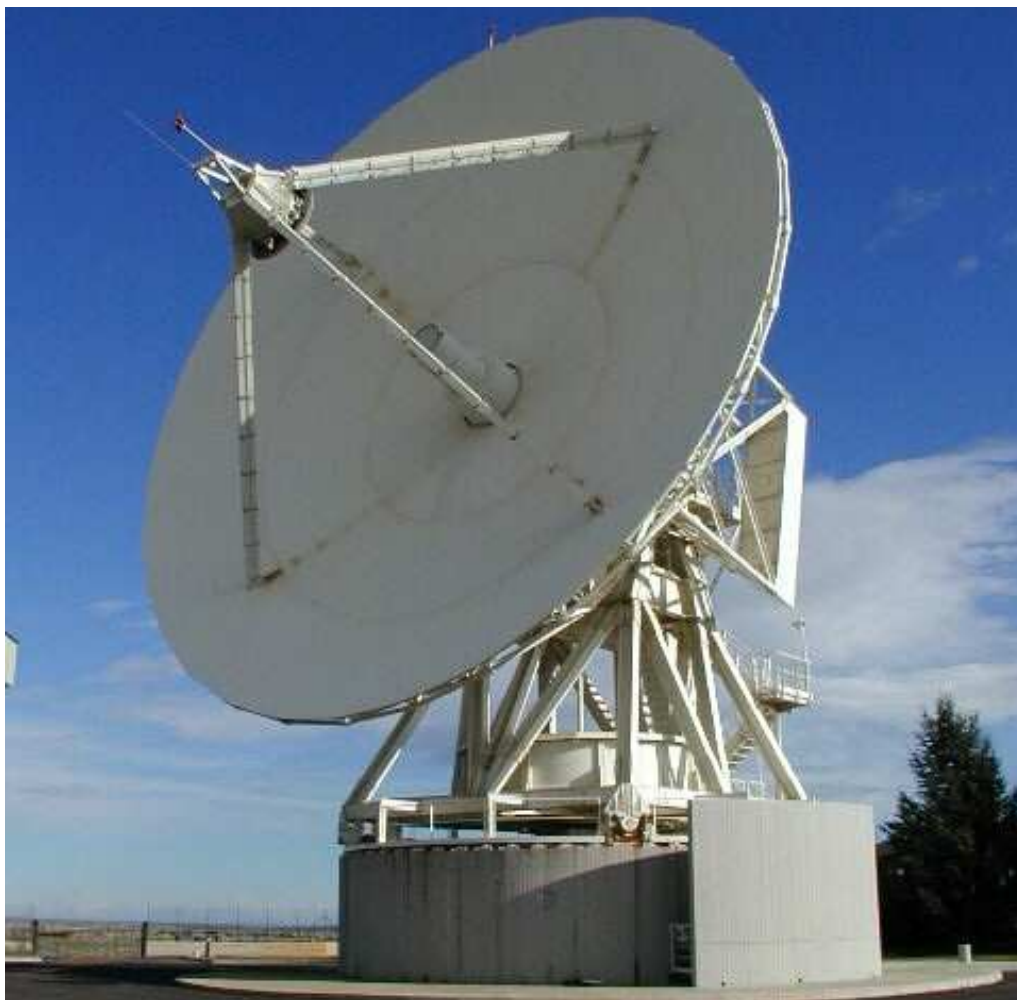
Fig. 1 VLBI antenna.