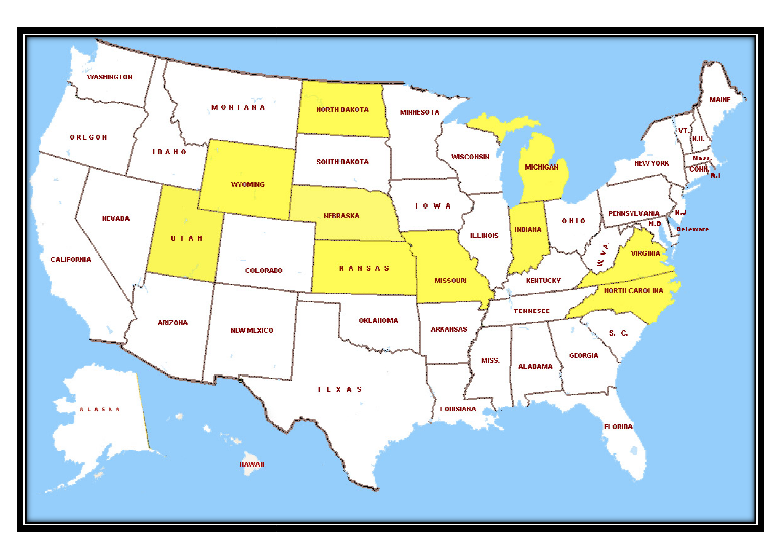
FIGURE 11 POLLINA CORPORATE TOP 10 PRO-BUSINESS STATES MAP

As Figure 11 illustrates, the geographic distribution of the Pollina Corporate Top 10 Pro-Business States (shaded area) is dominated by the West, with two states in the Southeast and two in the North. The biggest gaps are in New England, and the Pacific states.