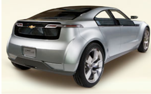
Look, no exhaust pipe