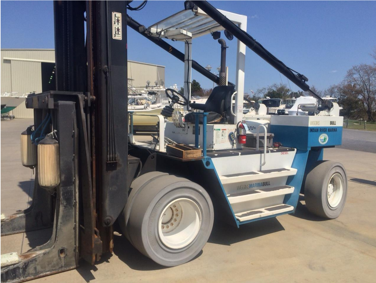
Wiggins Marina Bull model 22,000