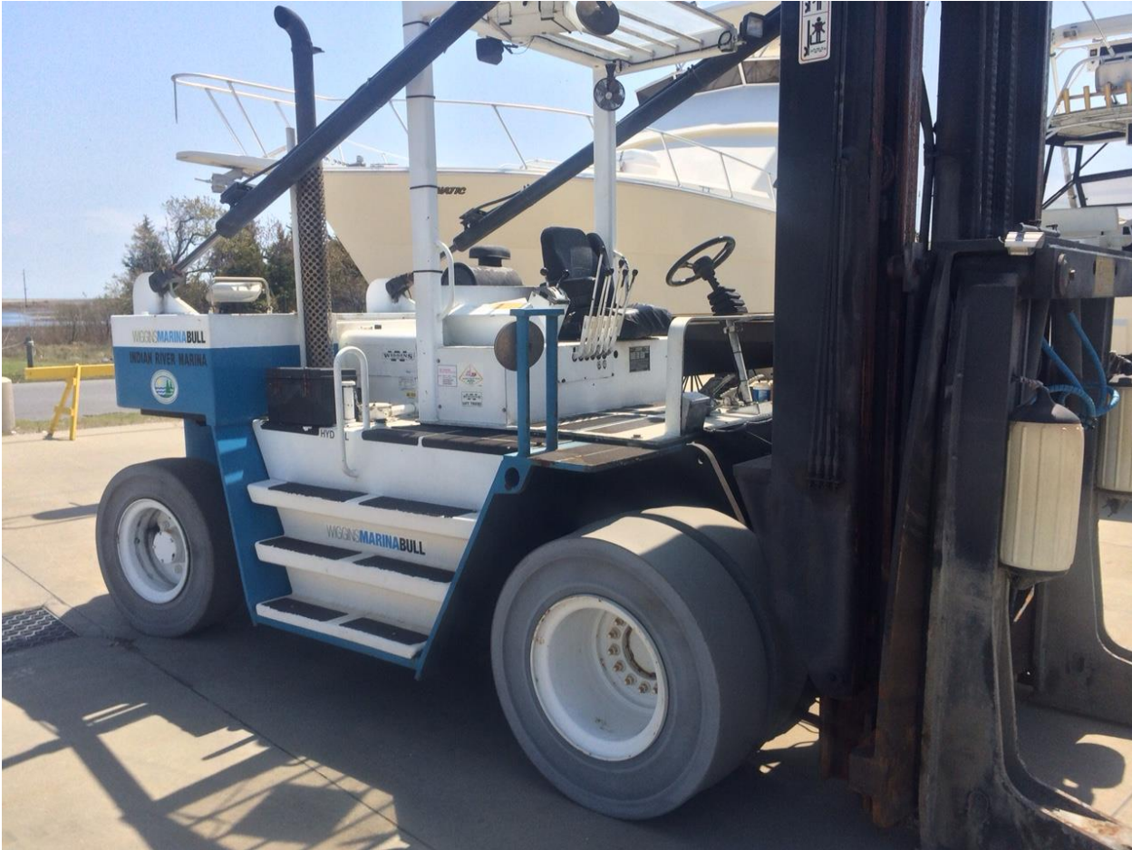
Wiggins Marina Bull model 22,000