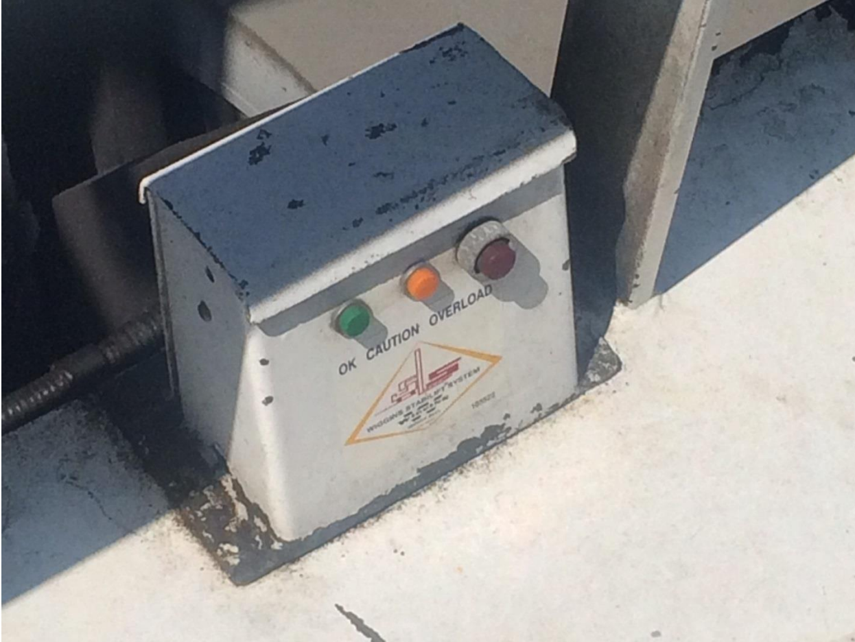
Wiggins Marina Bull model 22,000