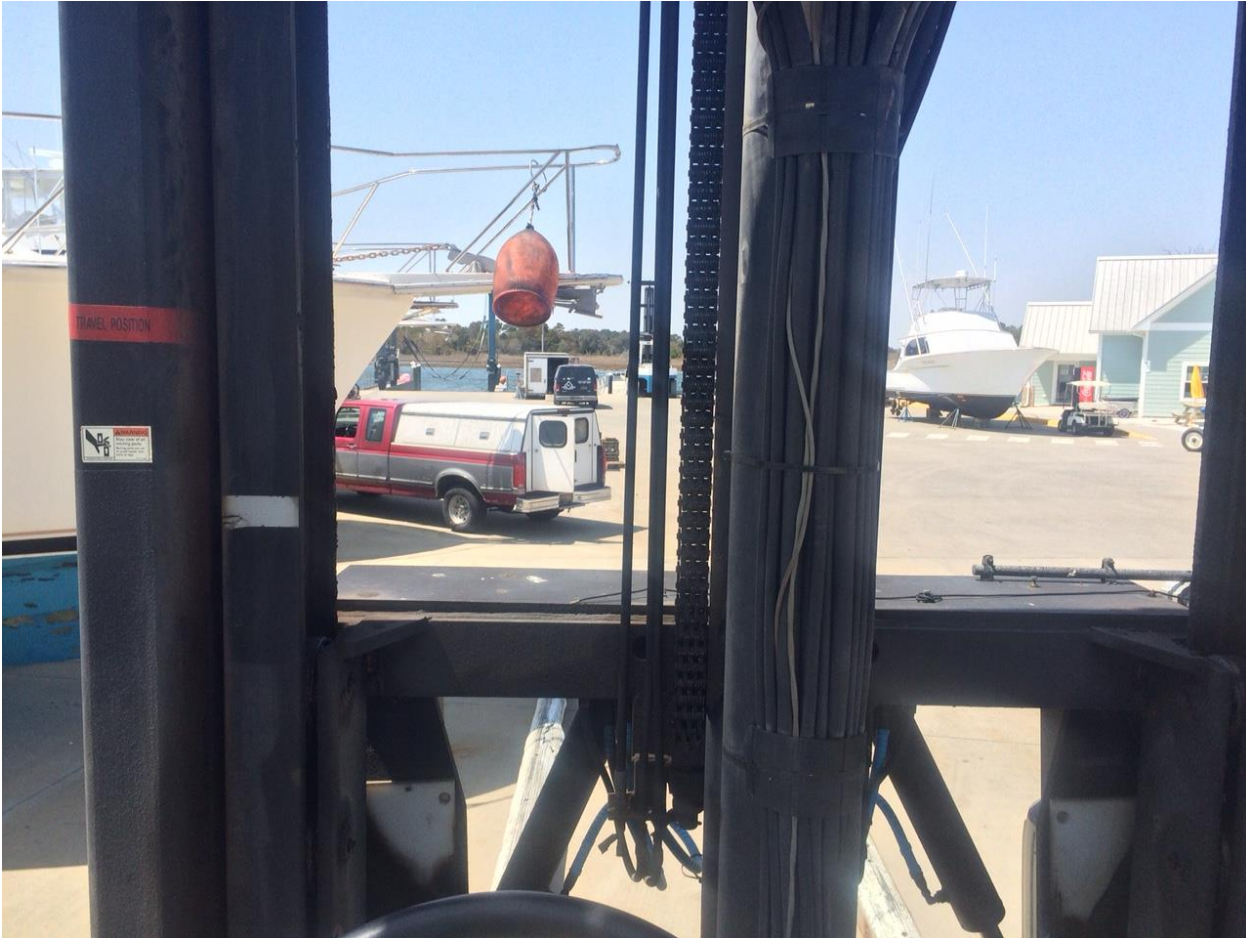
Wiggins Marina Bull model 22,000