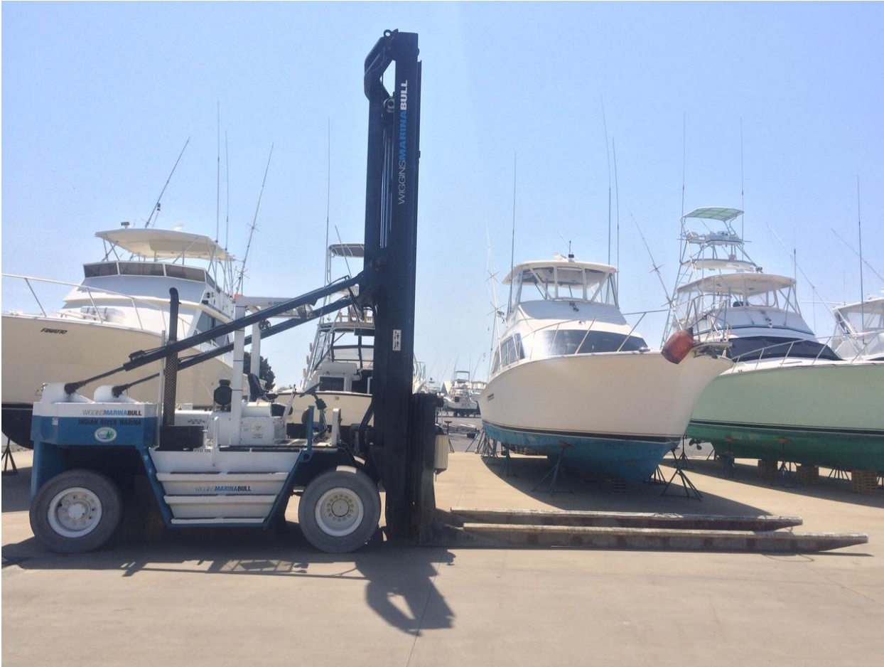
Wiggins Marina Bull model 22,000