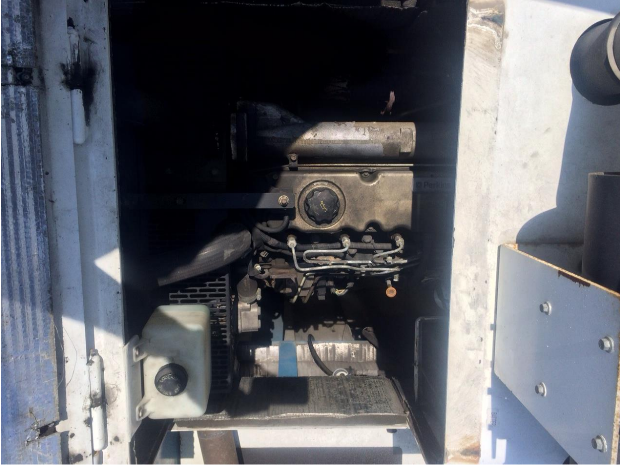
Wiggins Marina Bull model 22,000