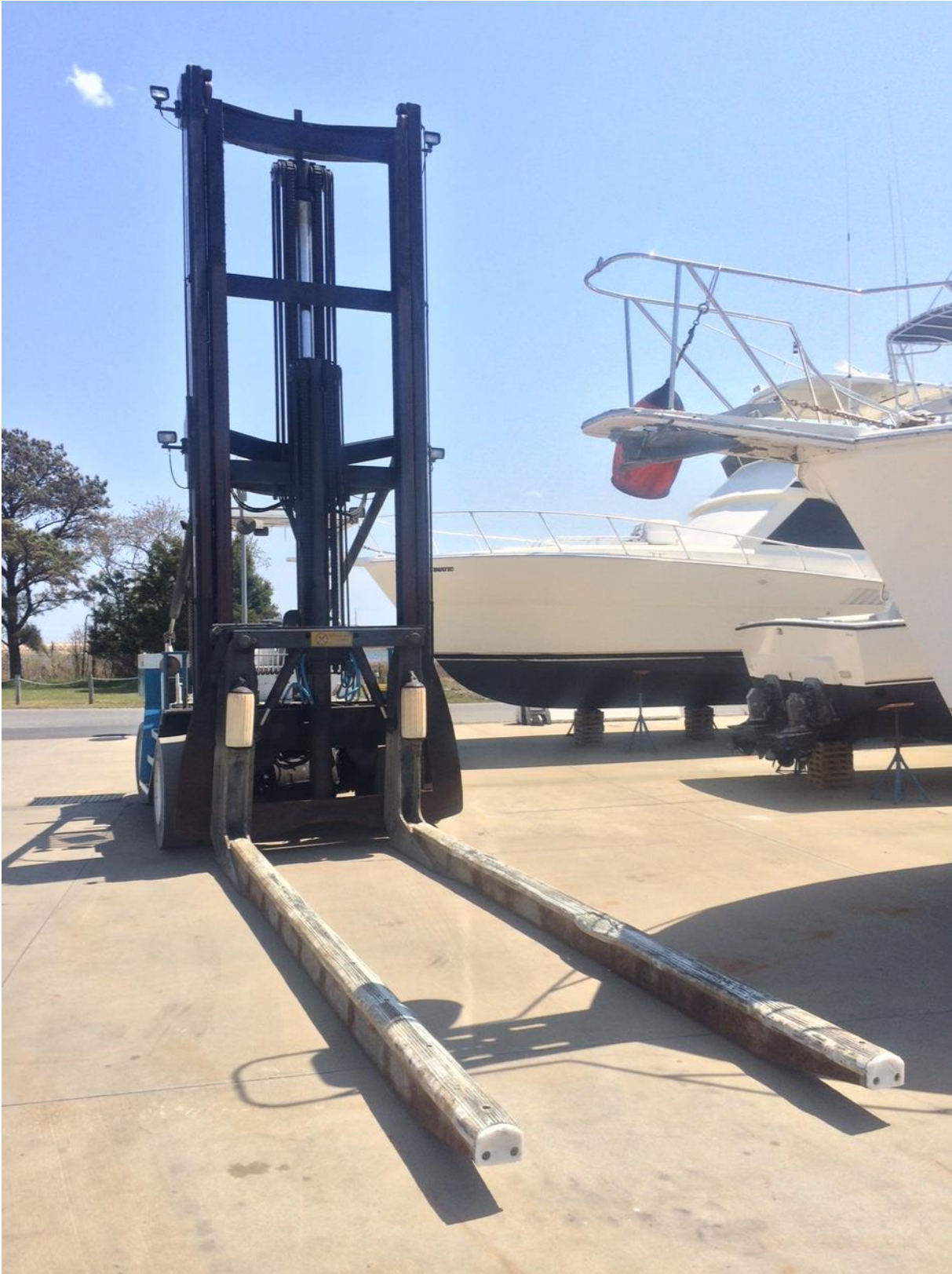
Wiggins Marina Bull model 22,000