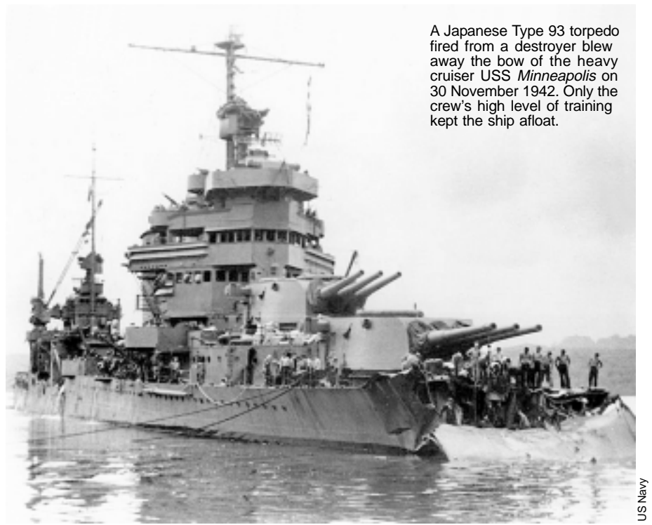
The Japanese Navy developed the Type 93 Long Lance torpedo that carried a large warhead and could travel 20,000 yards or more at speeds of up to 45 knots. The Japanese had an ideal fire-and-forget system. In consequence, the Japanese trained to fight at night, with radically maneuvering destroyers and cruisers that fired torpedoes.

tactics is highly circumstantial and is both science and art. U.S. Army Field Manual (FM) 3-90, Tactics, states, "The science of tactics encompasses the understanding of those military aspects of tactics capabilities, techniques, and procedures—that can be measured and codified. The art of tactics consists of three interrelated aspects: the creative and flexible array of means to accomplish assigned missions; decisionmaking under conditions of uncertainty when faced with an intelligent enemy; and understanding the human dimension—the effects of combat on soldiers. The tactician invokes the art of tactics to solve tactical problems within his commander's intent by choosing from interrelated options, such as forms of maneuver, tactical mission tasks, and arrangement and choice of control measures." Note, in particular, the description of the art of tactics—"decisionmaking under conditions of uncertainty when faced with an intelligent enemy" for this is almost a direct link between tactics and asymmetry.8