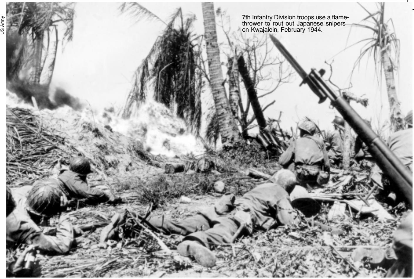
Marines and soldiers developed specialized drills for eliminating Japanese caves and underground fortifications during the war in the Pacific. Making changes to techniques and procedures that will be effective across the force requires experimentation, training, and dissemination. These actions are part of the adaptive nature of combat.