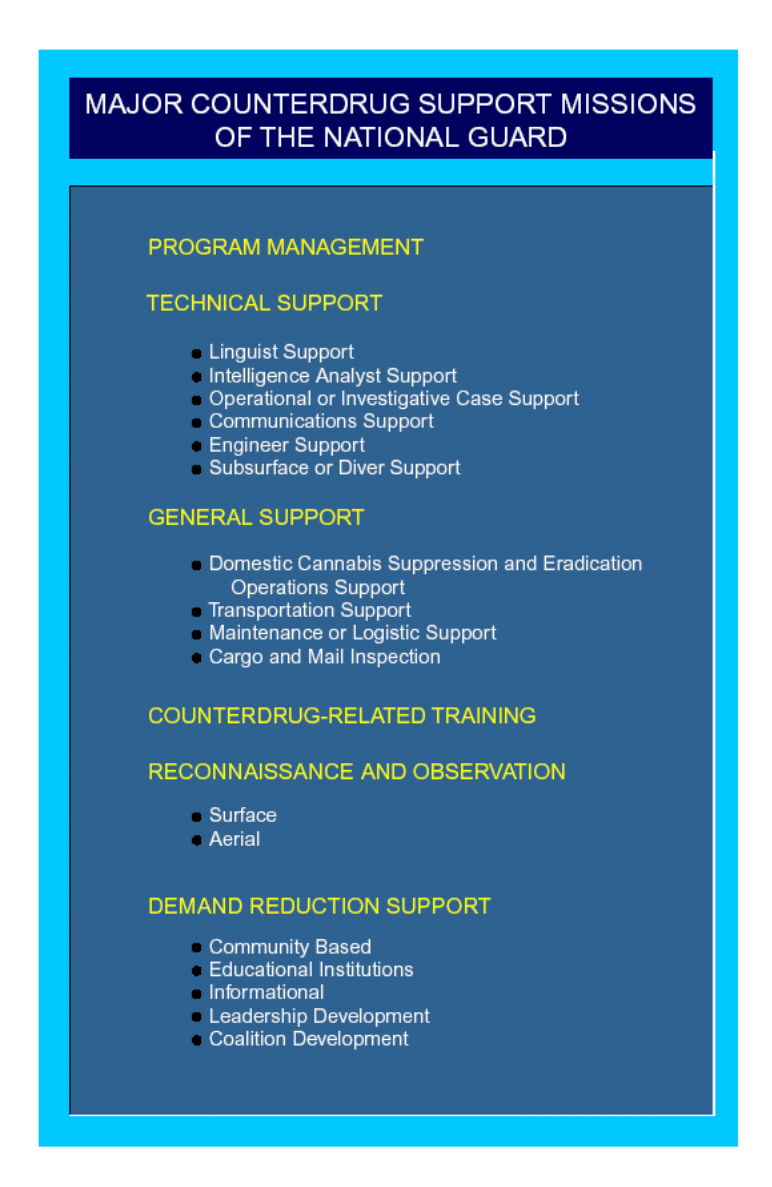
Figure 3.1 NG CD Missions (From JP 3-07.4, Joint CD Opns, III-32)

order to meet the needs of each state in the war on drugs.<sup>60</sup> If CD assets are made dual-use for HLS then existing resources will be leveraged to provide additional capability to each state in the war on terror.