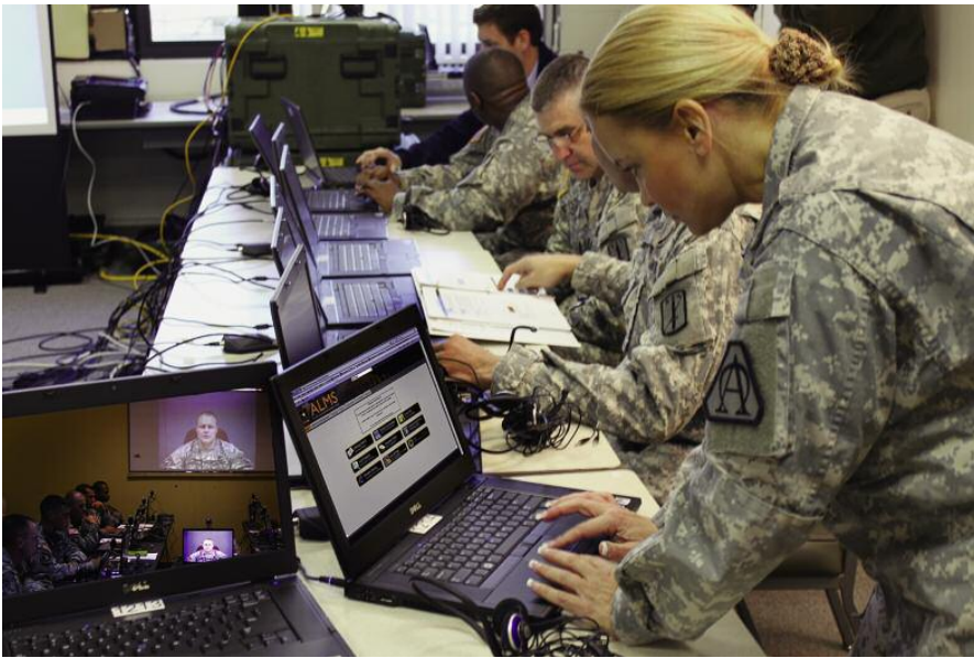
Deployed Digital Training Campus

crement 0. BEC Increment 1 is an acquisition category 1AC program and will replace DoD ABIS v1.2 in FY 2016. Planned capability improvements include a customizable, Web-based, biometrically enabled watch list; a Web-based nonsecure and secure Internet protocol router interface; additional sizing/throughput; mission assurance category level II sensitive continuity of operations; and faster automated biometric match processing times.