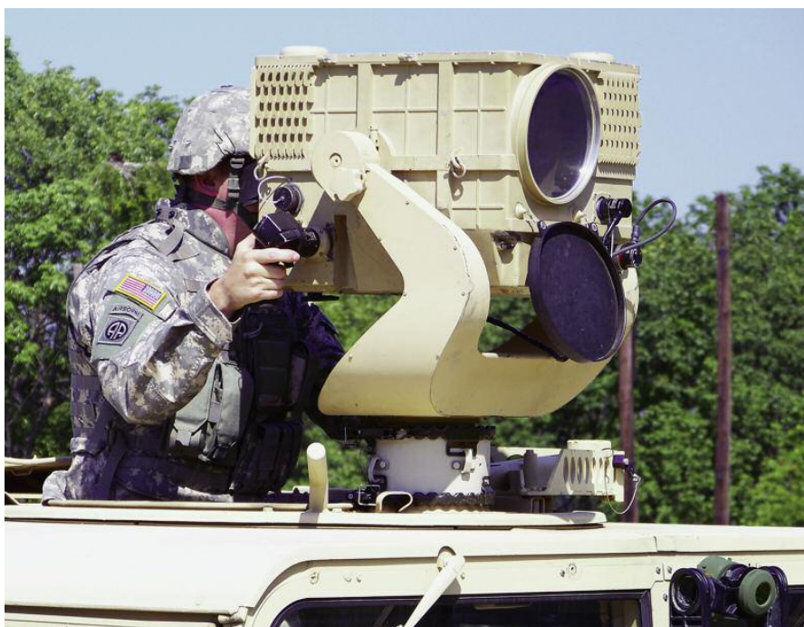
Netted Long Range Advanced Scout Surveillance System

The Base Expeditionary Target Surveillance System-Combined (BETSS-C) is a family of systems that uses existing sensors and new technologies to deliver an integrated view of situational data, improving the accuracy and breadth of situational awareness in theater and saving lives. As such, BETSS-C has been seen as a proof of concept for the provision of integrated ISR data and was recognized as a DoD Top 5 Program for Systems Engineering Excellence in 2009. Soldiers have noted that enemy activity in the vicinity of a forward