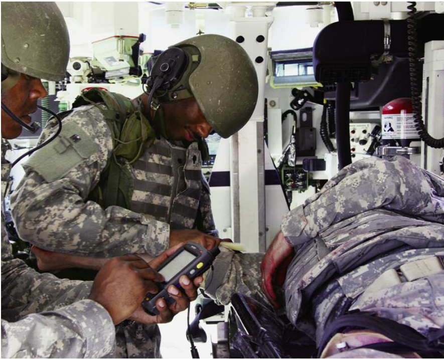
Medical Communications for Combat Casualty Care

soldiers' ability to conduct operations. These efforts are in direct support of the $10 billion transformation of forces in Korea from Cold War locations to the new alliance warfighting command structure, consolidating 104 camps and stations into 48 installations and two enduring hubs. This will align and shape the force structure based on U.S. and ROK enhanced capabilities, and it will position U.S. forces for increased peninsular and regional security.