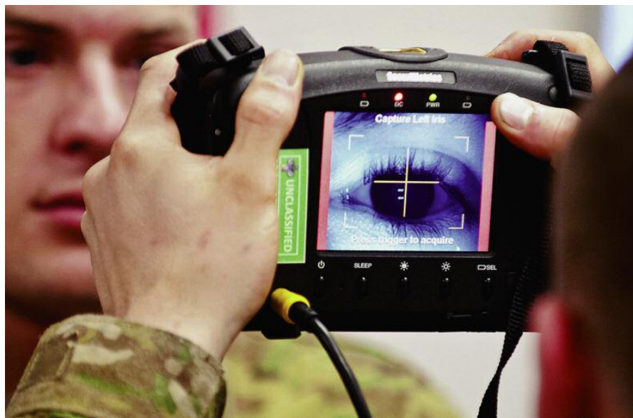
Handheld Interagency Identity Detection Equipment measures personal biometric data.

Biometric Enabling Capabilities (BEC) designs, engineers, develops, acquires, deploys and sustains an enterprise biometric system that serves as the DoD's authoritative biometric repository. This biometric system enables identity verification superiority across DoD as part of the BEC program of record. The DoD automated biometric identification system (DoD ABIS) was developed as a quick reaction capability (QRC) to receive multimodal biometric submissions from collection devices, allowing the soldier to positively identify and verify actual or potential adversaries. DoD ABIS v1.2 will be the initial baseline capability for the BEC program: BEC In-