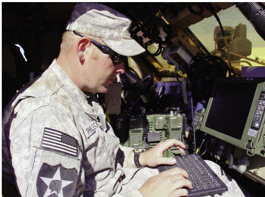
Warfighter Information Network-Tactical Increment 2

The Advanced Field Artillery Tactical Data System (AFATDS) is a digitized sensor-to-shooter link that provides automated technical and tactical fire-direction solutions, fire asset-management tools, and de-