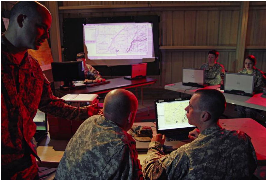
Distributed Common Ground System-Army

space. The LRAS3 provides long-range target acquisition capabilities to armor and infantry scouts, enabling them to conduct reconnaissance and surveillance operations while remaining outside of threat acquisition and engagement ranges. By networking one LRAS3 with another (Netted LRAS3), operators will be able to share information across each netted LRAS3, thereby achieving a more integrated view of the battlespace.