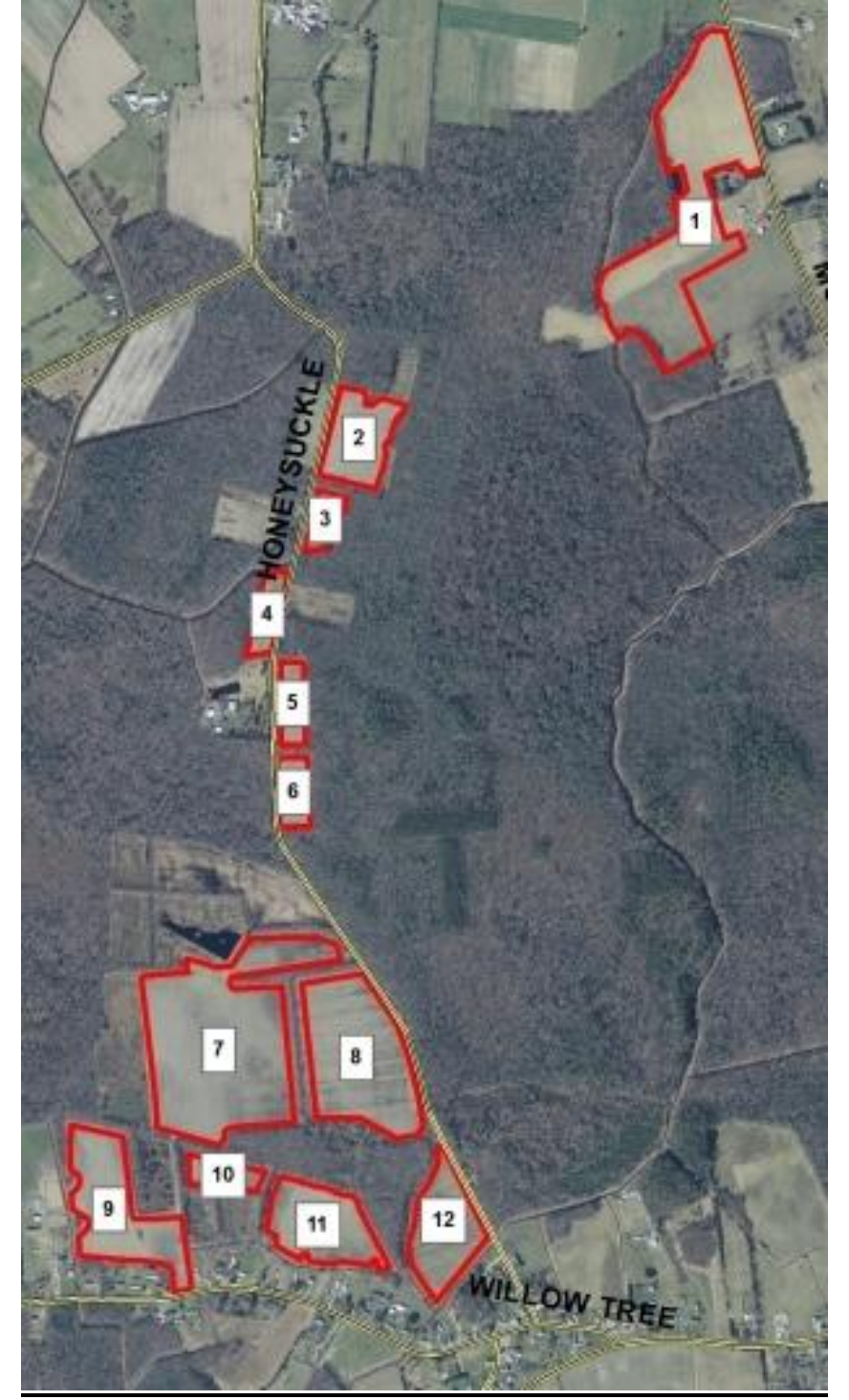
Exhibit 1. Aerial view of Norman G. Wilder Wildlife Area - Willow Grove, Caulk, Bartsch, and Bennett Tracts showing agricultural fields near Felton, Delaware.