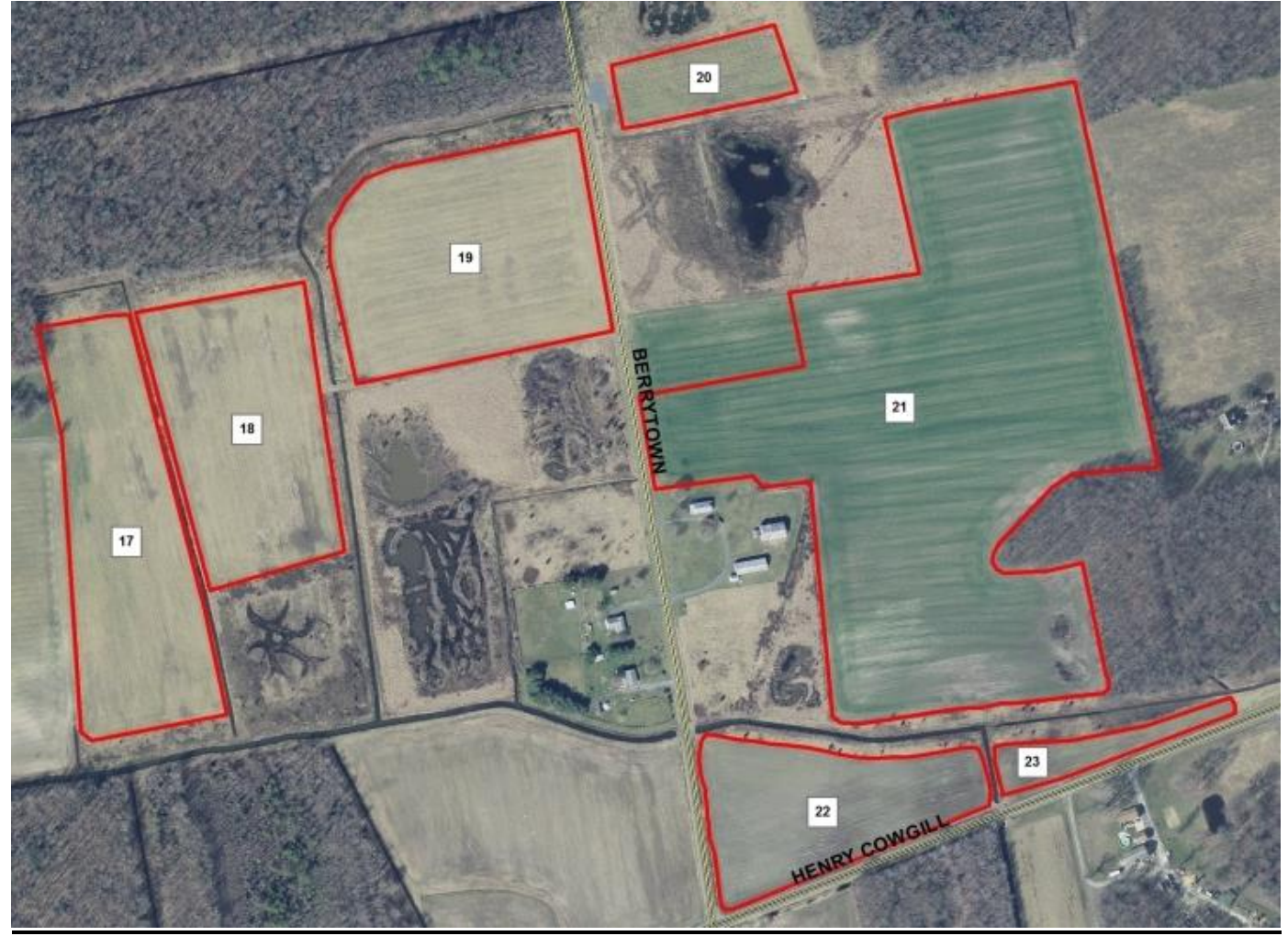
Exhibit 1. Aerial view of Norman G. Wilder Wildlife Area - Willow Grove, Caulk, Bartsch, and Bennett Tracts showing agricultural fields near Felton, Delaware.