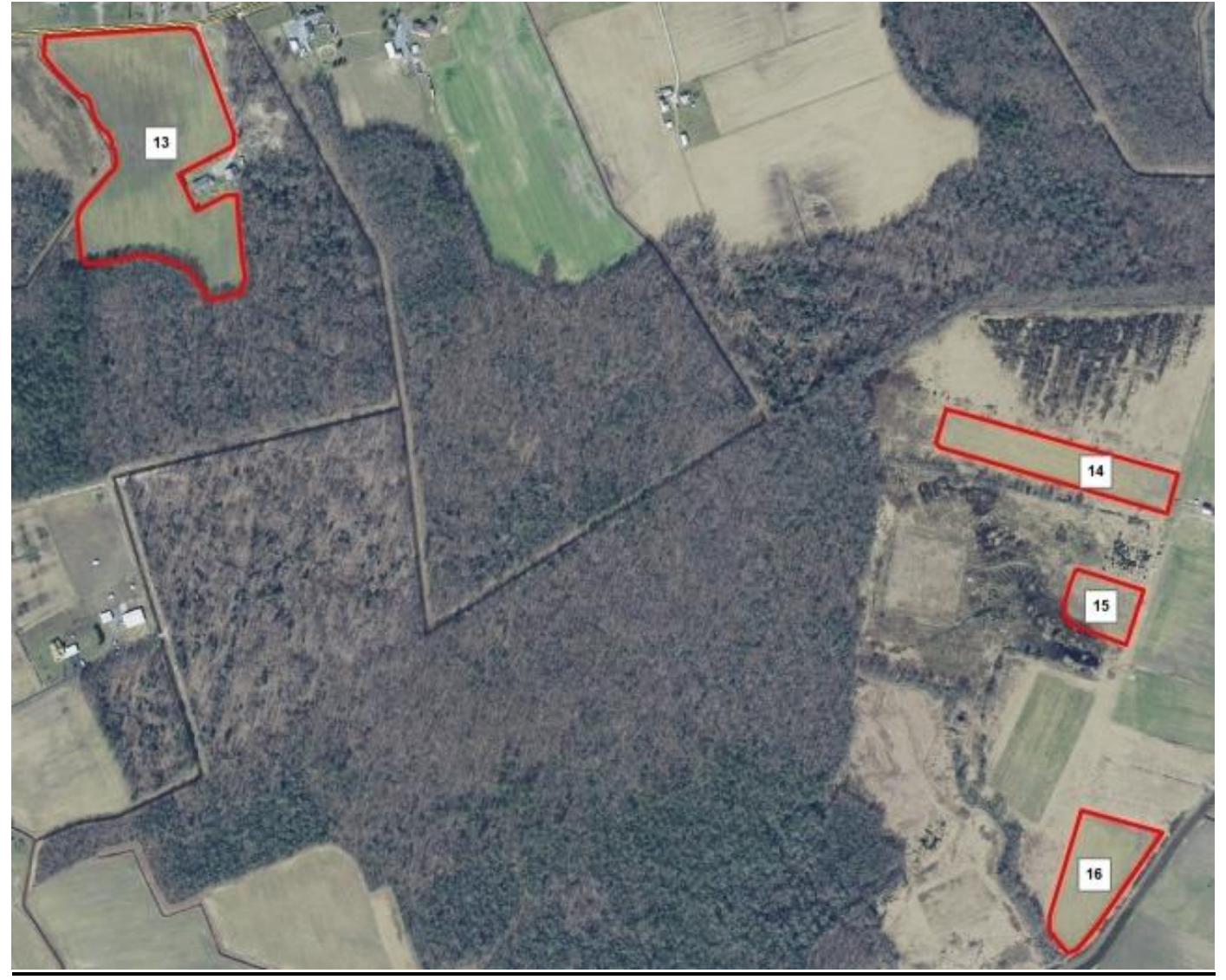
Exhibit 1. Aerial view of Norman G. Wilder Wildlife Area - Willow Grove, Caulk, Bartsch, and Bennett Tracts showing agricultural fields near Felton, Delaware.