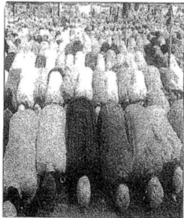
Baitul Mukarram, the national Mosque in Dhaka

Durga Puja (community worshipping of goddess Durga) is one of the greatest festivals of the Hindus. The occasion (ten day in October) of puja is a period of joy and amusement. At this time music and other amusements are performed. Friends and relatives are also invited to dinner. All Hindus celebrate the puja with pomp and splendor. The goddess Durga is worshiped