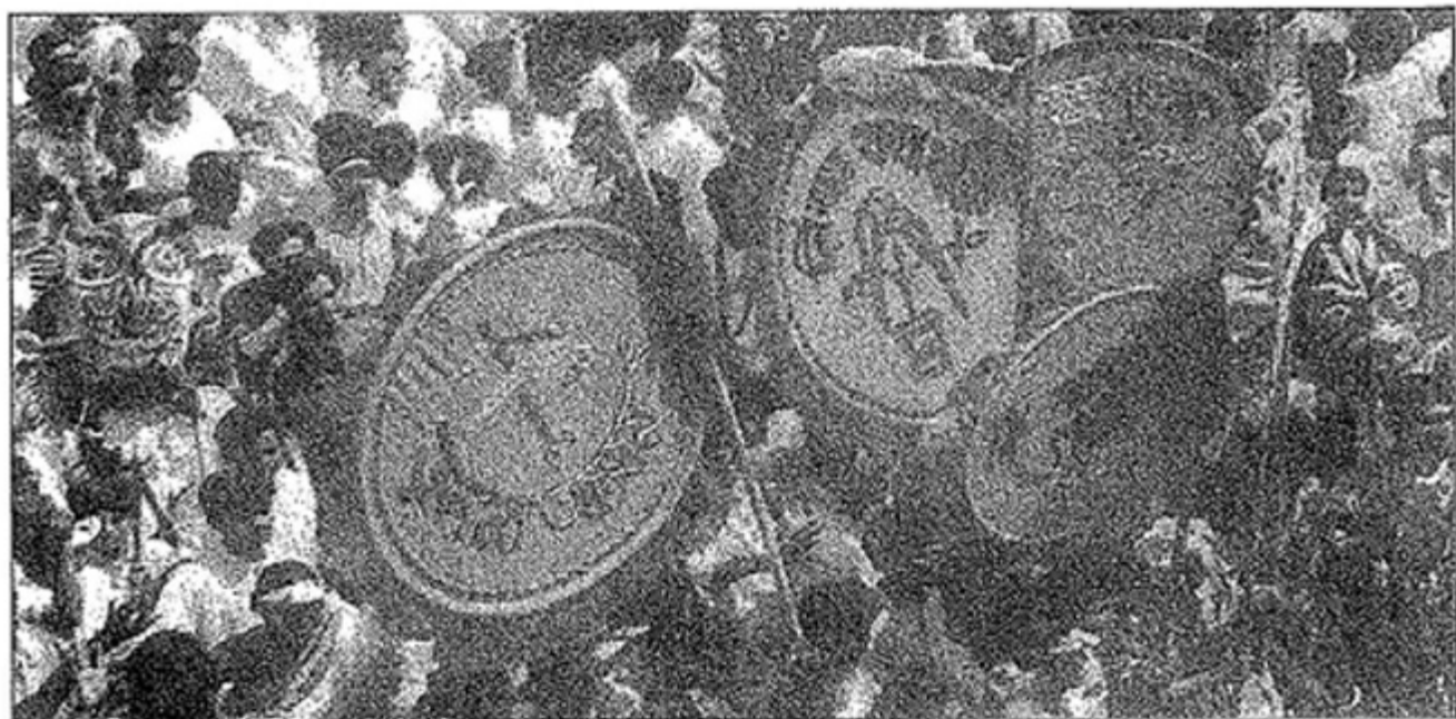
Cultural Festival of Bengali New Year in Bangladesh.