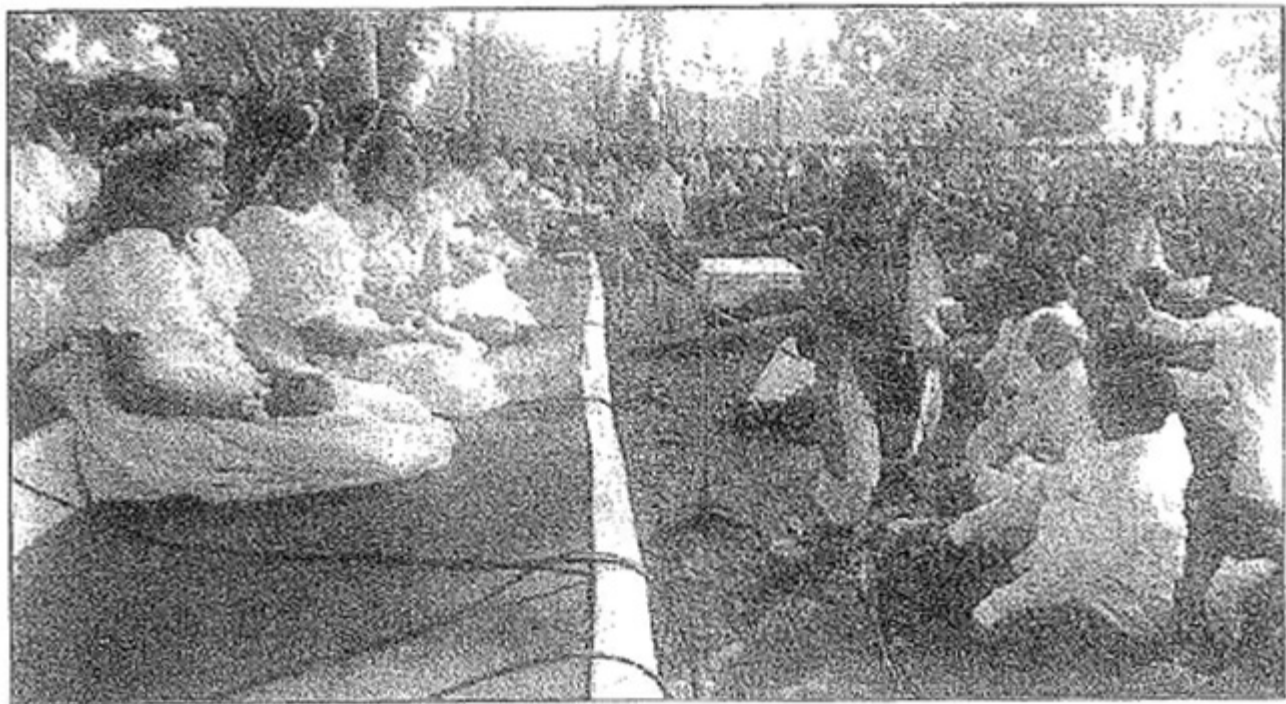
Celebration of Bengali New Year's Day

peoples from various walks of life enjoy poetry, music, drama and dance. The day starts with partaking of a breakfast of cheera, gur and yogurt. Then people get dressed to go to the fairs at an appointed place. The fair brings commodities of every sort, food of every variety and sweets of endless kinds. The sight of clay dolls and toys made of plastic and rubber delights the children. Gradually Pahela Baishakh has been becoming popular with the rise of national consciousness.