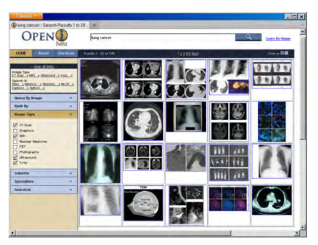
Fig. 4. Search results in a grid display.

Based on the principles developed by [16], the search results are displayed either on a grid that allows a view of all top 20 retrieved images (Fig. 4), or as a traditional list in Fig. 1. In either layout, scrolling over the image brings