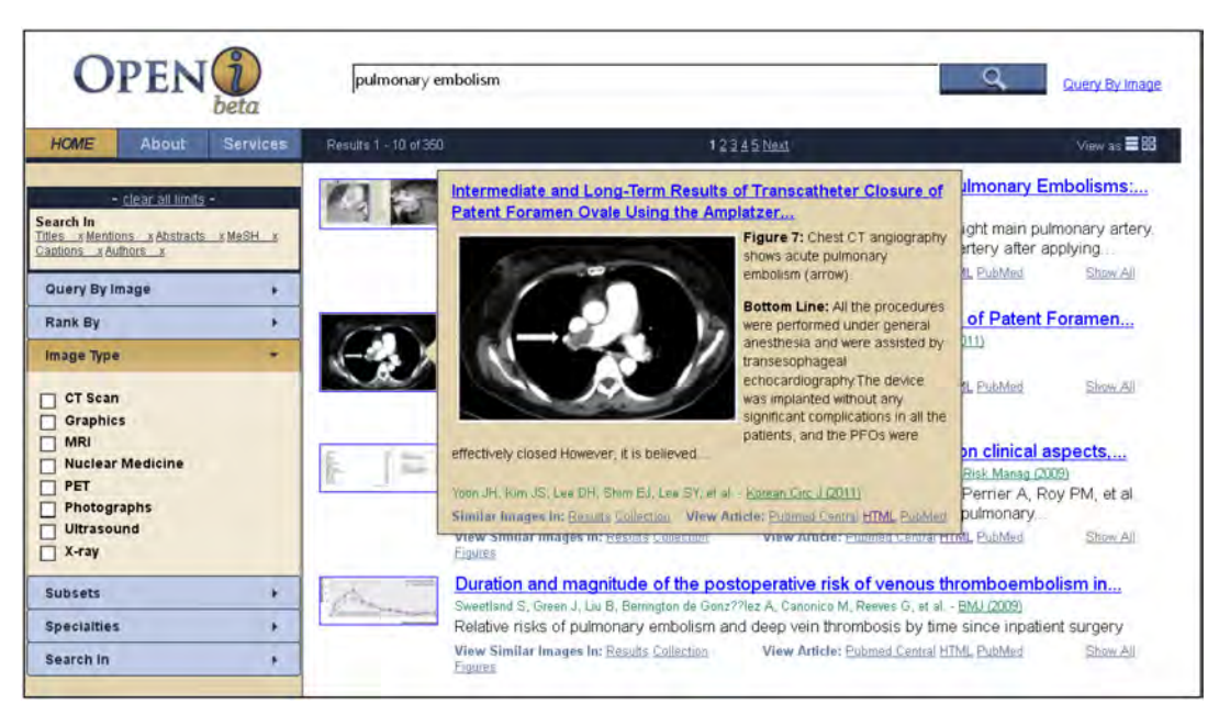
Fig. 1. Textual search results in the list view of the OpenI system. The navigation panel on the left allows filtering and sorting search results along several facets. The pop-up window that appears on scrolling over the image provides a brief, but key, summary of the information in the article.