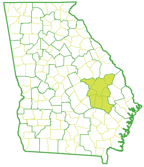
Service Delivery Area: Candler, Emanuel, Jenkins, Johnson, Montgomery, Tattnall, Toombs and Treutlen counties