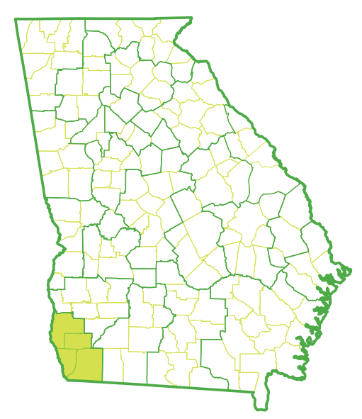
Technical Division Service Delivery Area: Decatur, Early, Miller and Seminole counties