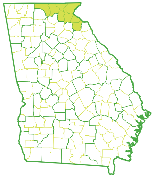
Service Delivery Area: Fannin, Franklin, Habersham, Rabun, Stephens. Towns. Union and White counties

North Georgia Technical College 1500 Hwy. 197 N.