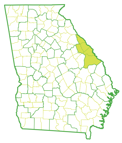
Service Delivery Area: Burke, Columbia, Lincoln, McDuffie and Richmond counties

Augusta Technical College 3200 Augusta Tech Drive Augusta, GA 30906