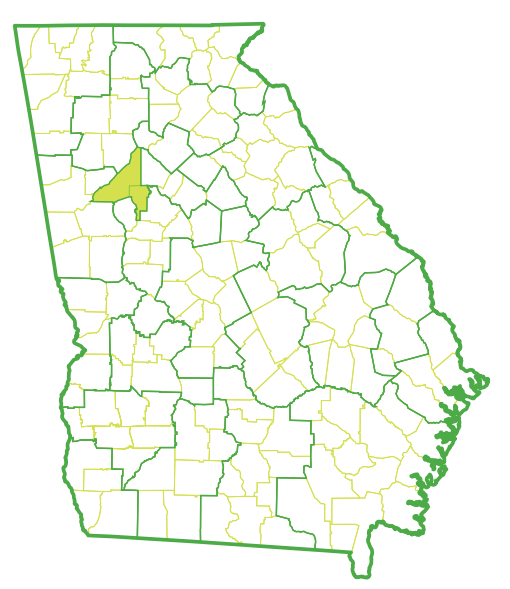
Service Delivery Area: Fulton and Clayton counties

Atlanta Technical College 1560 Metropolitan Pkwy. SW Atlanta, GA 30310