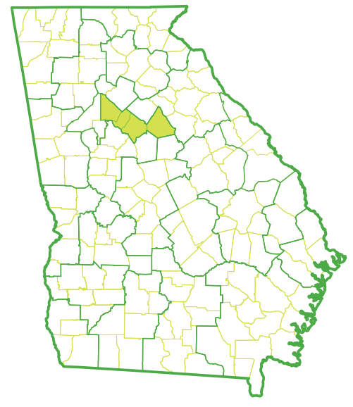
Service Delivery Area: DeKalb, Morgan, Newton and Rockdale counties