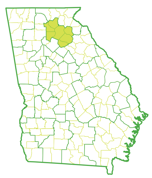
Service Delivery Area: Banks, Barrow, Dawson, Forsyth, Hall, Jackson and Lumpkin counties

Lanier Technical College 2990 Landrum Education Dr. Oakwood, GA 30566