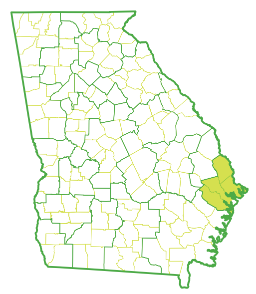
Service Delivery Area: Bryan, Chatham, Effingham and Liberty counties

Savannah Technical College 5717 White Bluff Road Savannah, GA 31405-5591