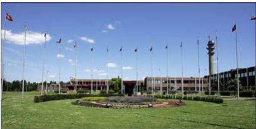
NATO's Joint Forces Command Headquarters in Brunssum, Netherlands