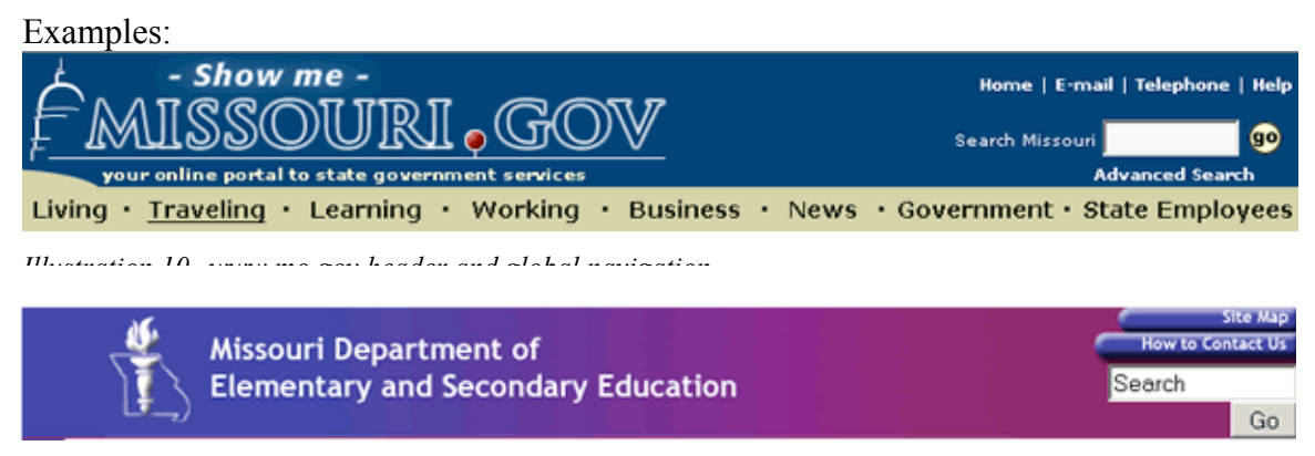
Illustration 0 DESE hanner and alobal novigation