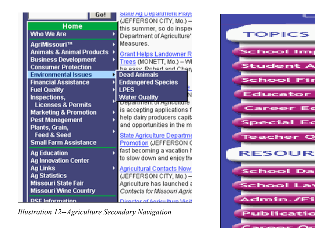
Illustration 11--DESE Secondary Navigation

Secondary navigation can also be included in a header or footer, like Natural Resources does in this example: