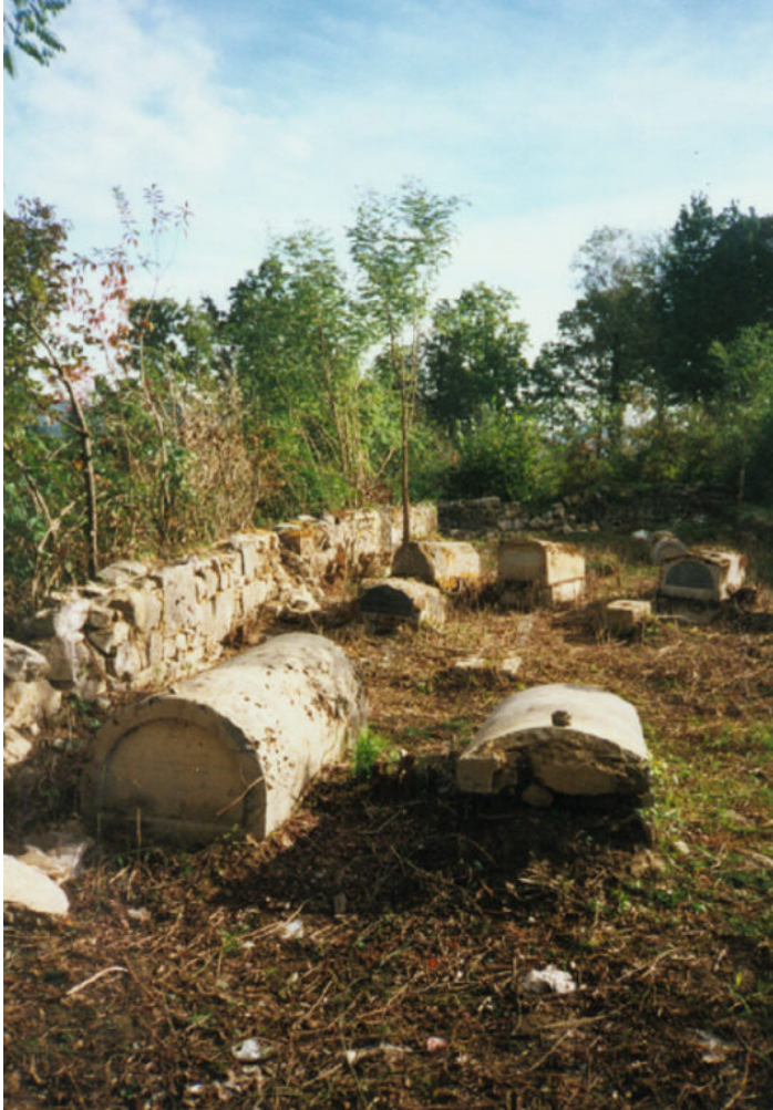
Sanski Most cemetery.