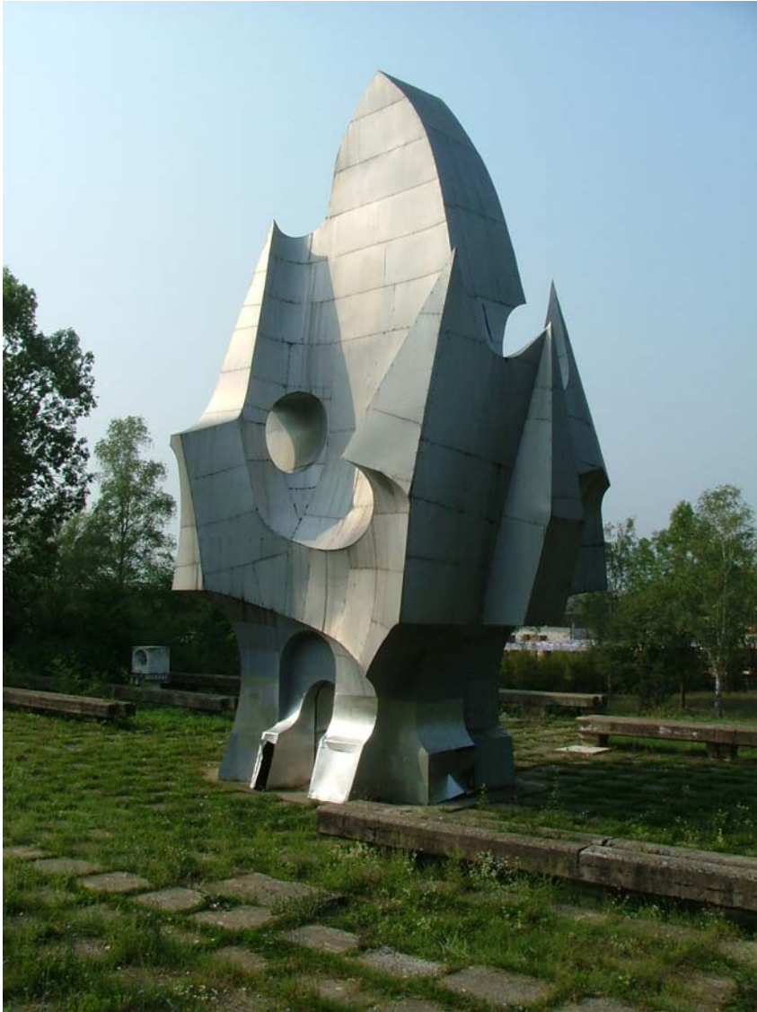
Sanski Most Holocaust memorial.

the fallen fighters set along the edges of the paths that criss-cross the site. Today, only names of Serbian and Jewish origin, together with the “unknowns,” are visible. All others have been removed. This is possibly a result of action taken by the Serbs during the period of ethnic cleansing. When visited in 2004, the monument was not repaired, even though the town was then entirely Muslim.