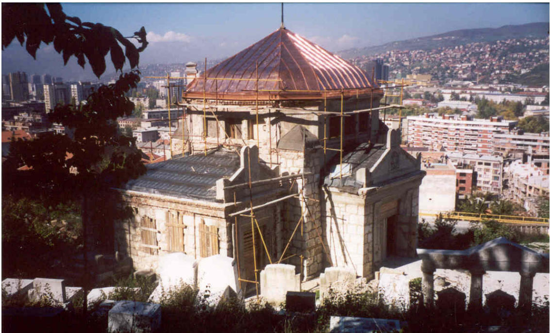
Pre-burial house under renovation.