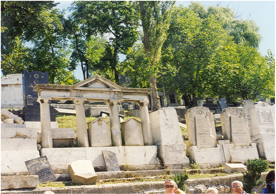
Old Sephardic cemetery.