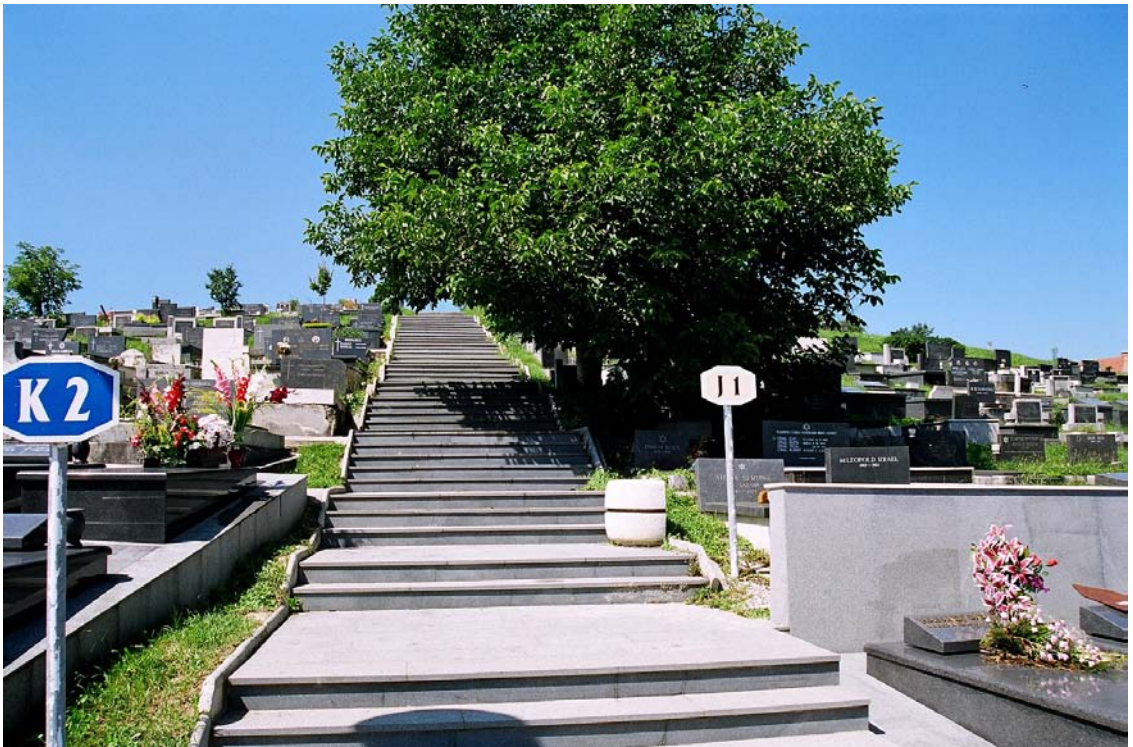
Old Sephardic cemetery.