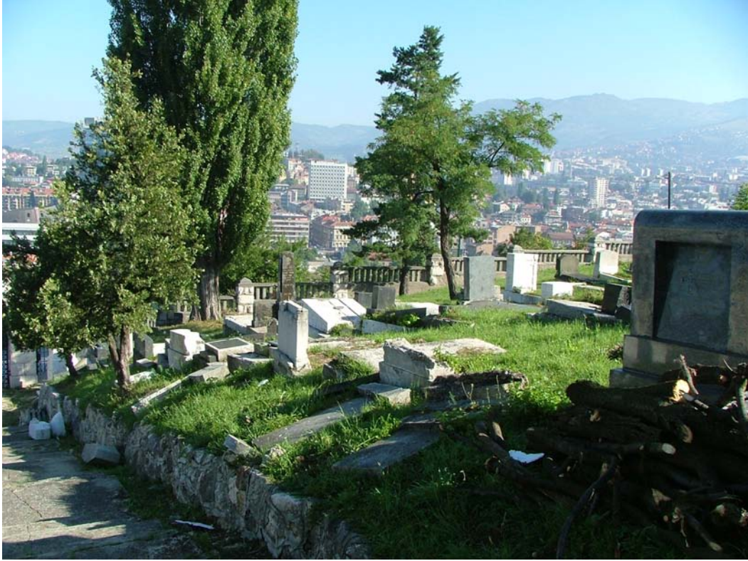
Old Sephardic cemetery.