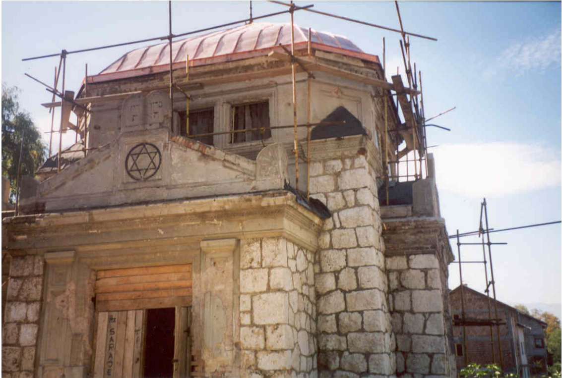
Pre-burial house under renovation.