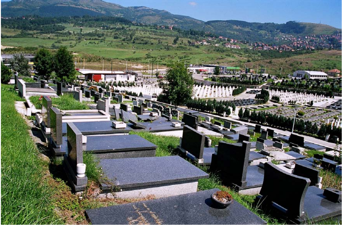
Old Sephardic cemetery.