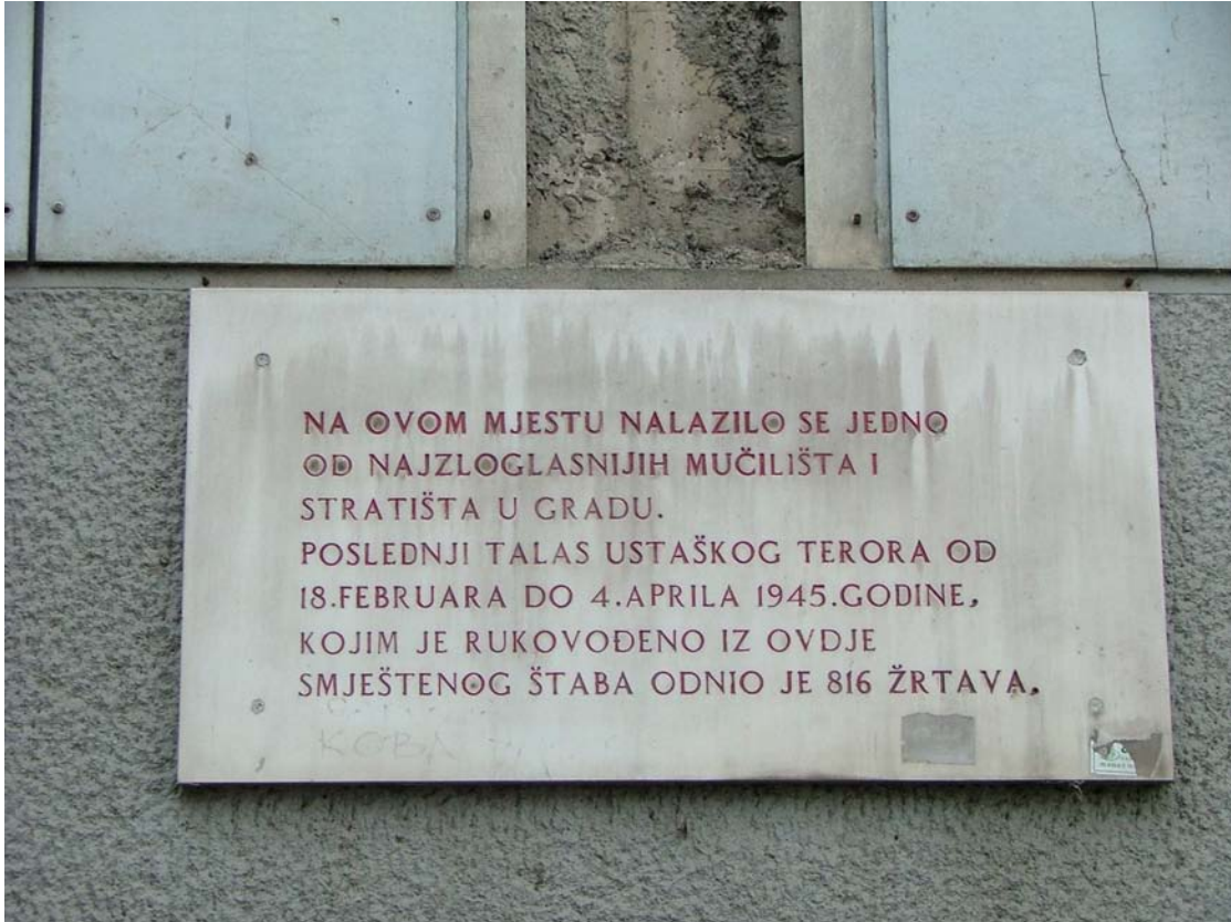
Plaque to Holocaust victims.