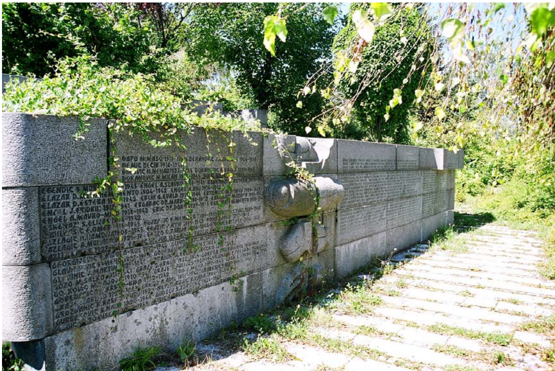
Holocaust memorial wall with names of victims inscribed.