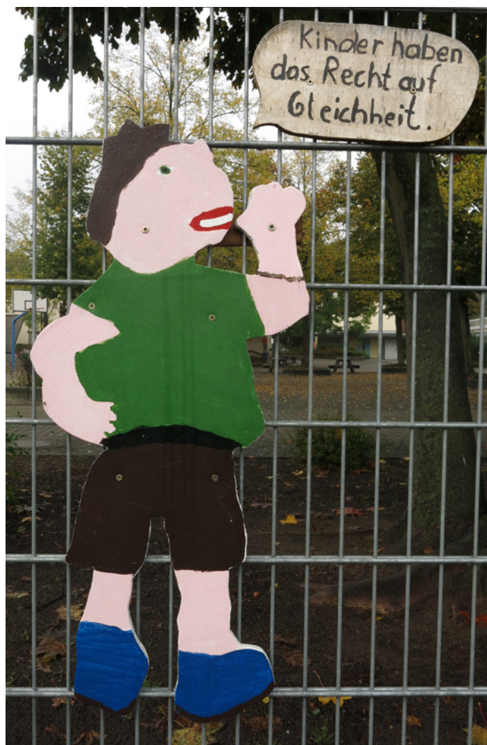
'Children have the right to equality', Albert-Schweitzer-Schule, Germany

Respondents were largely sceptical about the barriers to implementing human rights education, including lack of support for the CRC and a more general traditional of American 'exceptionalism'.