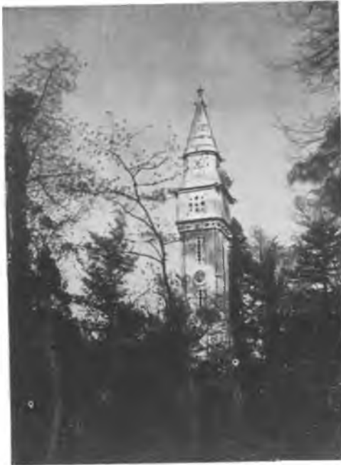
MCCARTHY MONUMENT, Diamond Hill, Cork.