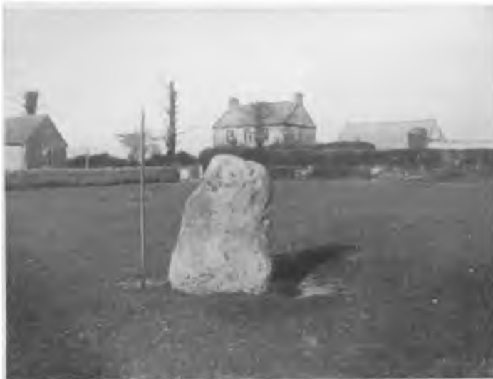
GALLAUN AT BALLINLOUGH.