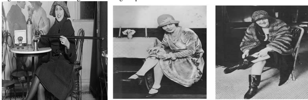
Figure 4: Ladies concealing alcohol during the prohibition era.