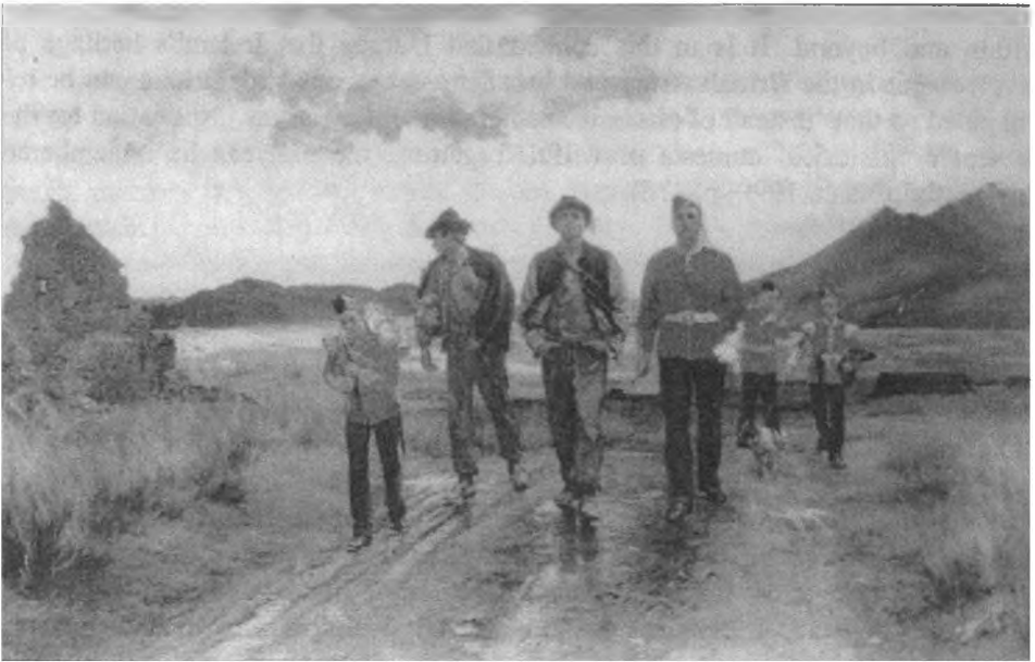
Figure 3.1 'Listed for the Connaught Rangers' (1878) by Lady Butler