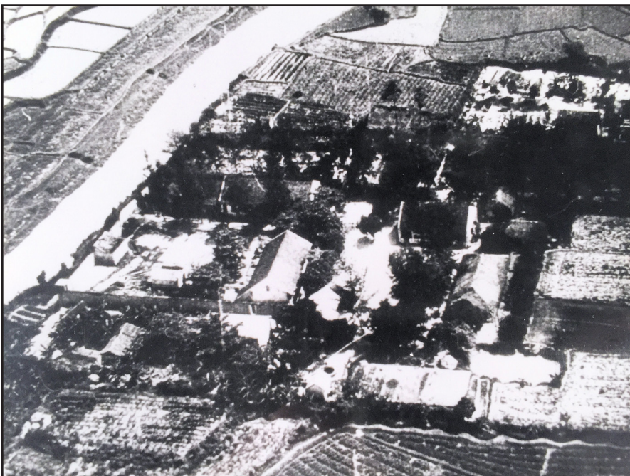
Son Tay prison was located more than 20 miles northwest of Hanoi. POWs held there were able eventually communicate their location. The knowledge allowed the United States to mount a rescue attempt. Unfortunately, the prisoners had been removed before the November 1970 raid.