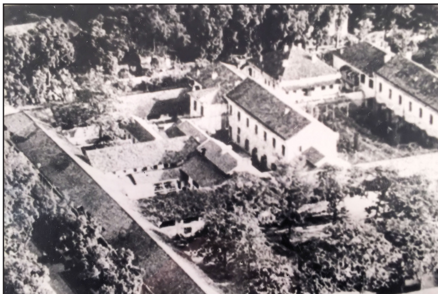
The Hoa Lo prison, built by the French during their colonial rule of Vietnam. US prisoners dubbed it the Hanoi Hilton.