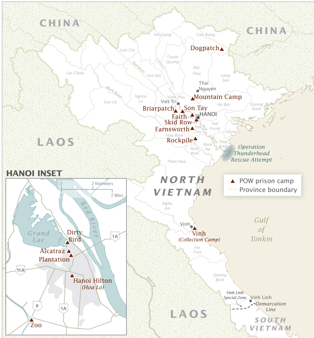
(U) Small numbers of US POWs were held in South Vietnam, Cambodia, and Laos, but the majority, mostly Navy and Air Force aviators, were held in 15 camps dispersed in North Vietnam. The largest was Hoa Lo prison, in central Hanoi. Data derived from map in official DOD history of Vietnam War POWs.