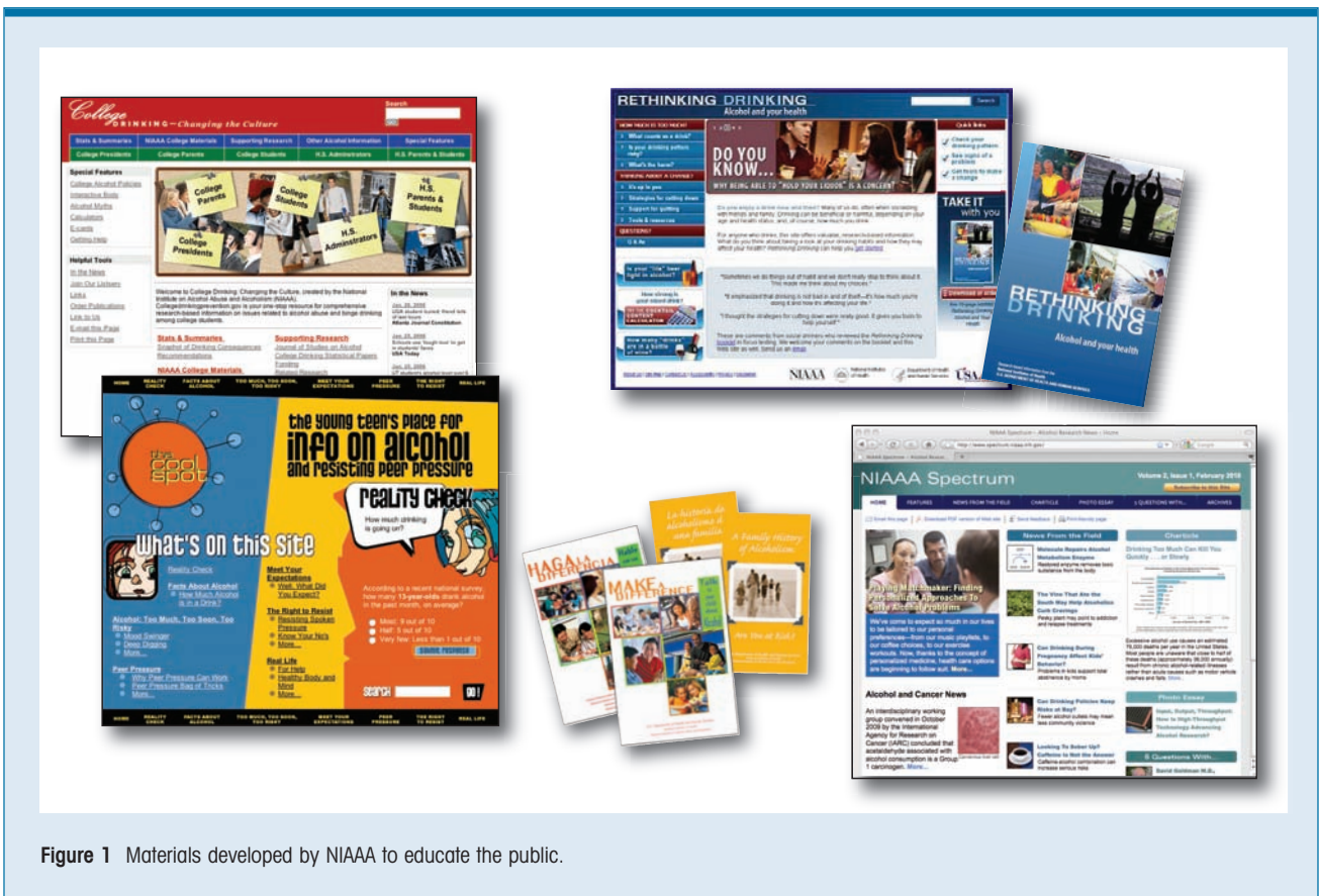
Figure 1 Materials developed by NIAAA to educate the public.

Research findings about the best ways to prevent and treat alcohol problems can have a significant impact on public health but only if those findings are adequately reported and translated to the relevant audiences. An important part of NIAAA's mission, therefore, is "translating and disseminating research findings to health care providers, researchers, policymakers, and the public." NIAAA's pioneering work in public outreach, communications, and clinician training aims to stimulate new areas of research and foster growth in the field; to improve prevention efforts and treatment outcomes; and to educate the general public about alcohol and alcoholism. Through its award-winning publications, Web sites, e-learning tools, and public service announcements, NIAAA targets a variety of audiences.