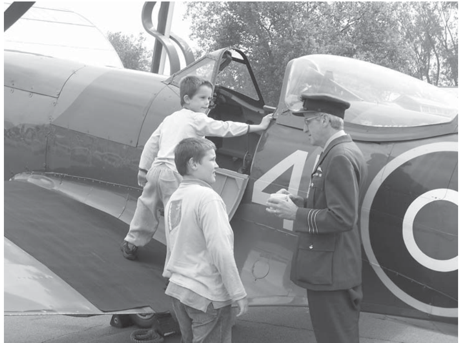
Engaging some of the younger members of our audience.

2 document study sessions were held. The first involved a group of gifted/ talented students from a local secondary school on the subject of the Battle of Britain. A talk on the themes of the Battle introduced the children to the concepts they would look at in the documents. After this, working in groups, they moved around various 'themed' tables examining primary sources and discussing them with the individual curators. Facsimiles were also supplied so the documents could be looked at in more depth and used to answer questions set by the teachers. Several themes caught the imagination of the children, such as the role of women in support of the war effort and the idea that people from ethnic backgrounds could serve in important posts. One Muslim girl was particularly fascinated by a