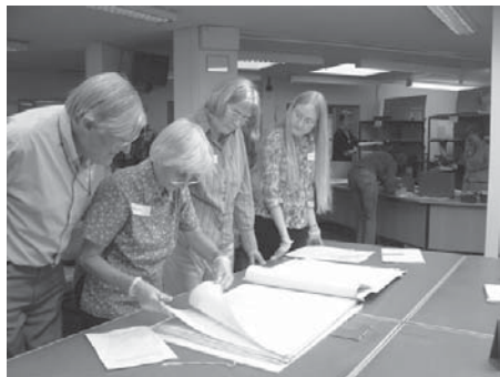
Studying a tithe appointment at one of the house history days.