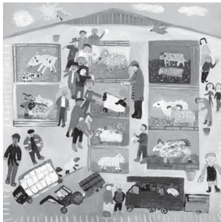
Primary school artwork produced during the Taunton Market Project.

Members of staff give talks to groups who request them on a variety of topics. In 2006 around 40 such talks were given in and out of the office. In 2006 as part of the Programme of Events additional talks were held at SRO for members of the public. Subjects included Army Records and the Somerset Light Infantry, Sources for Rural History, Sources for the History of Transport and Crime and Punishment in Somerset. Members of staff also give talks during events such as National Archaeology Week as part of the Somerset County Council Heritage Service. Staff have also contributed to a series of talks hosted by the Somerset Archaeological and Natural History