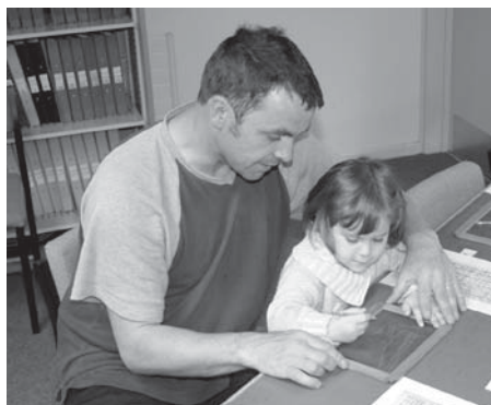
Learning how to write on a slate - one of the 2006 Open Day activities.

In May 2006, Somerset Record Office held an Open Day with a Significant Treasures Exhibition, tours of conservation and the strongrooms, exhibitions including a Friends of Somerset Archives stand, and interactive activities in the searchrooms. These included: a chance for children to