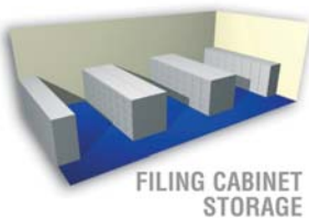
FILING CABINET STORAGE

Link 51 RollerStor - the simple way to specify mobile storage.