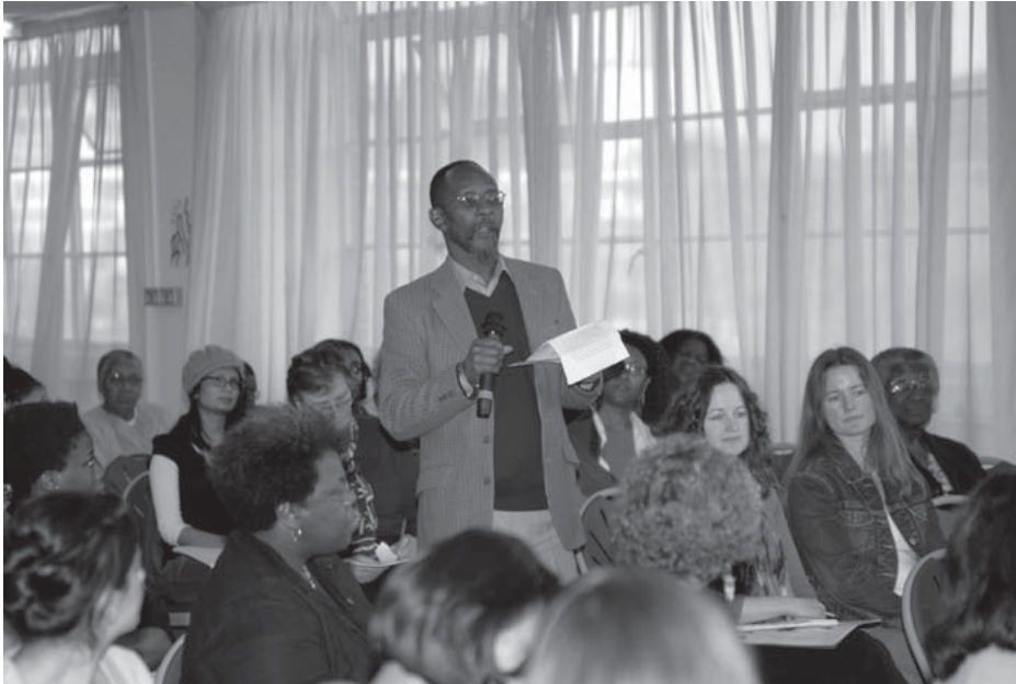
Linton Kwesi Johnson, poet asks a question of the panel.

struggles. To mark the depositing of their archive collections with London Metropolitan Archives, a launch event took place in February 2006 and a Huntley Conference is to be held annually. The conference is organised by a committee drawn from the Afro-Caribbean community, facilitated by staff at LMA.