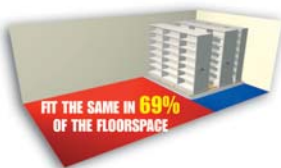
MOBILE SHELVING SYSTEM