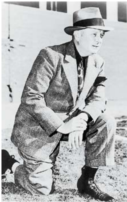
Cardinal owner Charles W. Bidwill, Sr. is a member of the Pro Football Hall of Fame.

The team sorely missed Nevers' magic on the field and the Cardinals endured difficult years in