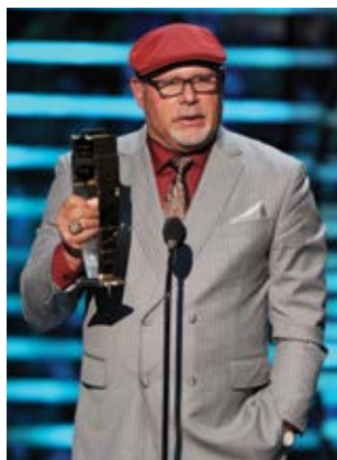
After leading the Cardinals to an 11-5 record and a spot in the post-season in 2014, Bruce Arians was named the Associated Press NFL Coach of the Year.

* Resigned after two games in 1931 ** Co-coach with Walt Kiesling of 1944 Card-Pitt. team *** Co-head coaches **** Released after 13 games in 1979