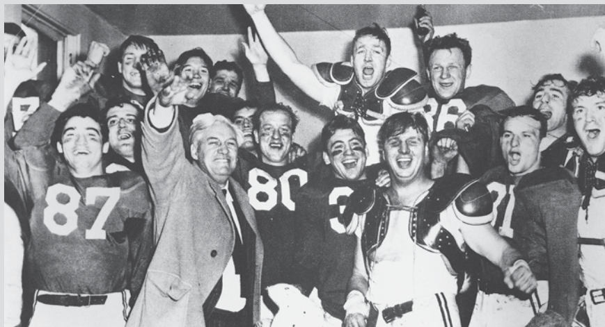
The 1947 Cardinals won the NFL Championship with a 10-3 overall record. They defeated the Philadelphia Eagles 28-21 at Chicago's Comiskey Park in the NFL's 15th title contest.