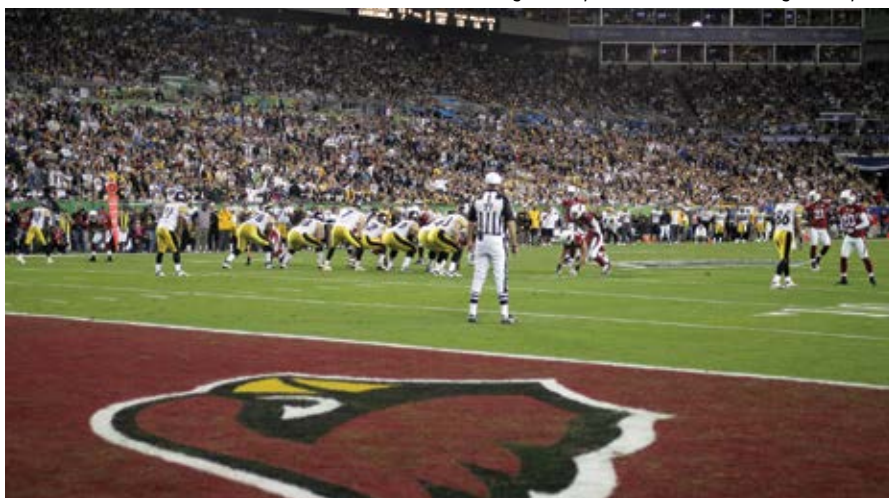
The Cardinals made their first-ever Super Bowl appearance when they met the Pittsburgh Steelers in Super Bowl XLIII.

The Cardinals success at home over the last two seasons has also transformed University of Phoenix Stadium into one of the most hostile venues in the NFL for opposing teams. Arizona’s seven home wins in 2014 were the most in a single season since 1925 (11) and the Cardinals 13-3 home mark over the last two years ranks among the top-five in the NFL during that span.