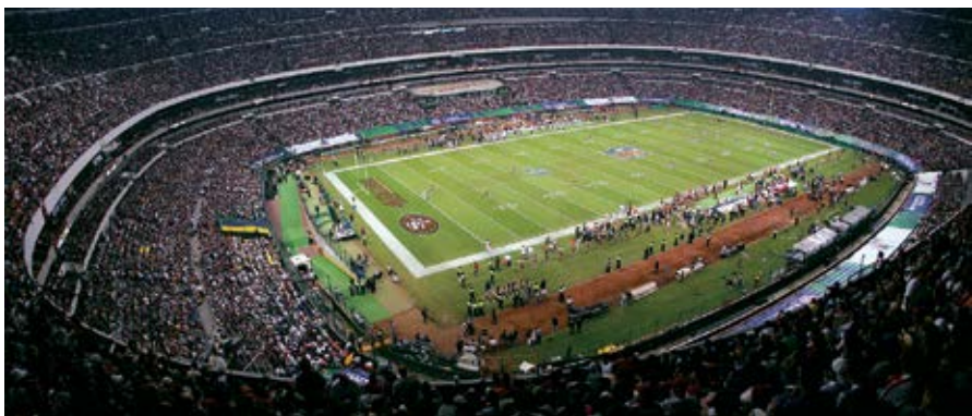
The Cardinals and 49ers made history by playing the NFL's first regular-season game outside the United States. The two teams played at Estadio Azteca in Mexico City in front of 103,467 fans on 10/2/05.

* denotes Thursday night game, all others are Sunday night games ** denotes Mexico City + denotes NFL attendance record & denotes flexed into Sunday night game