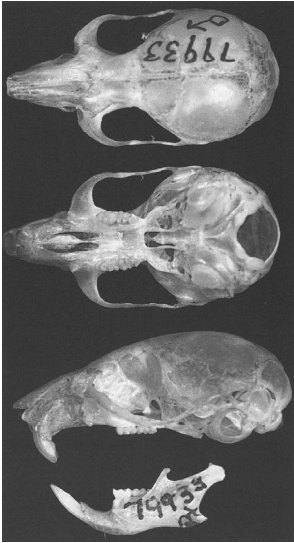
FIG. 2. Dorsal, ventral, and lateral views of the skull and lateral view of the mandible of Reithrodontomys humulus humulus from near Morton, Scott Co., Mississippi (male, University of Kansas Museum of Natural History 79933). Greatest length of skull is 19.0 mm.

in intermediate amounts, and sudoriferous and mucous types in trace amounts (Quay, 1965). Compared with gland densities of 13 related species, R. humulus lies in the middle of the range. One pair of mammae is pectoral and two pairs are inguinal.