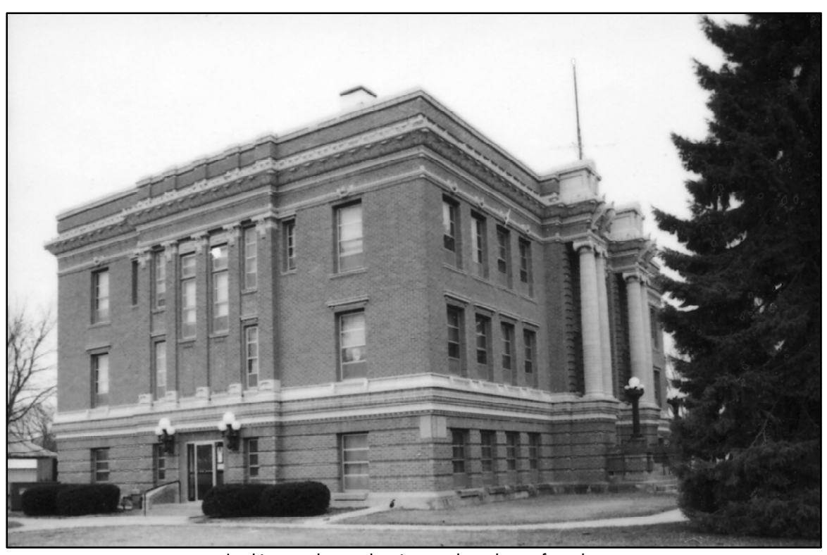
Looking southwest showing north and east facades Photo by BJB Long, Four Mile Research, 1989 (NSHS 8904/4:36)