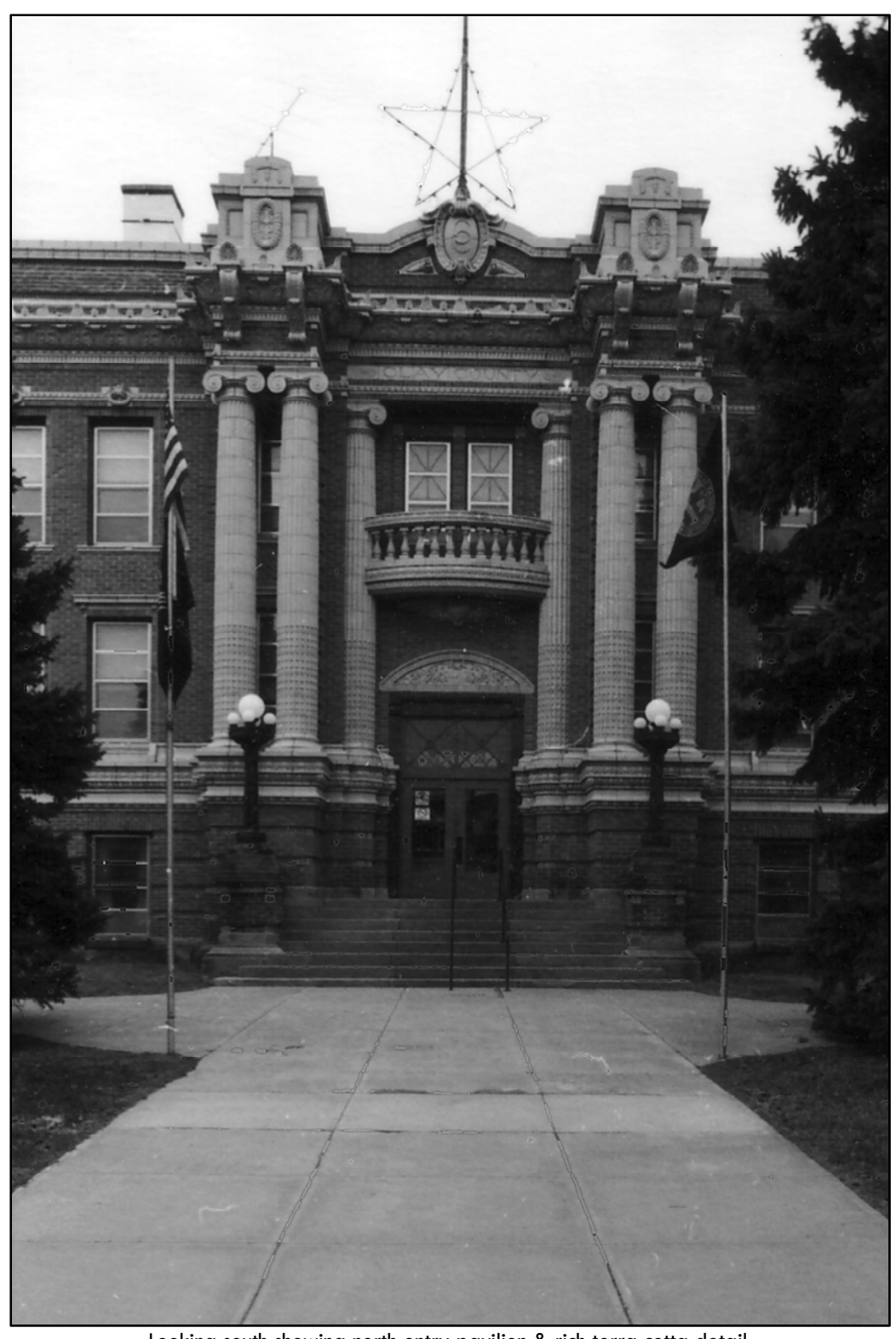
Looking south showing north entry pavilion & rich terra cotta detail Photo by BJB Long, Four Mile Research, 1989 (NSHS 8904/4:14)