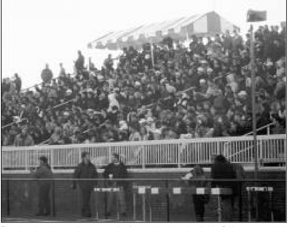
There have been three men's soccer crowds of more than 3,000 since Ludwig Field was constructed in 1995. An all-time high of 3,723 came out to Maryland's game with Virginia on Sept. 13, 1997.

In addition to the high-level of competition