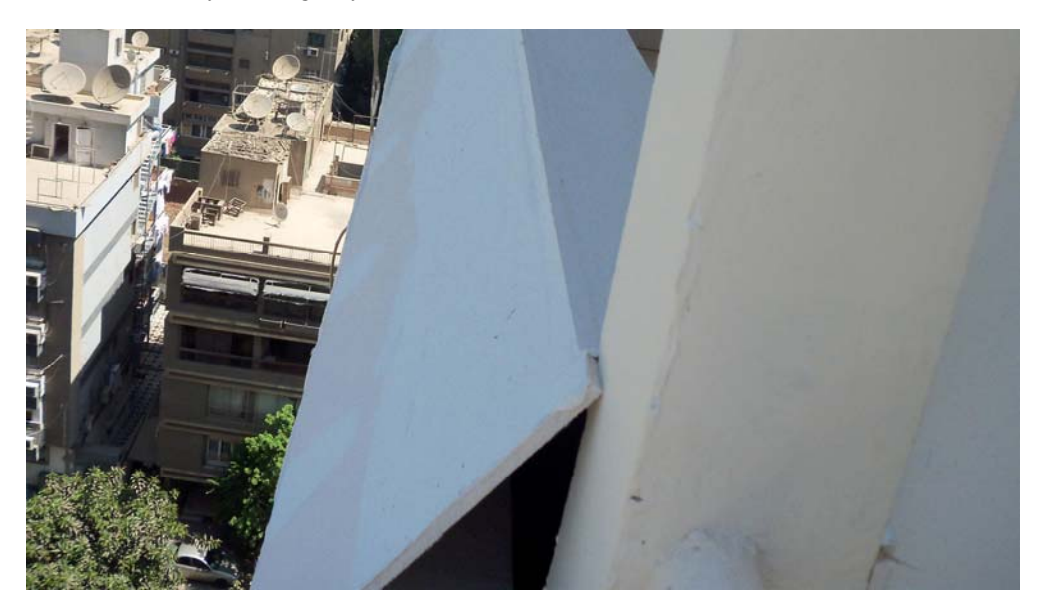
Fig. 3: Using Magnesium oxide boards as Building Façade shaping material.

Magnesium oxide board 10 mm thickness including support frame and workmanship is more expensive than Gypsum board for internal use thickness 10mm including supporting frame, and one square meter cement plaster on expanded metal including frame plaster and workmanship, but MgO board a lower life cycle cost because of their durability and longevity.