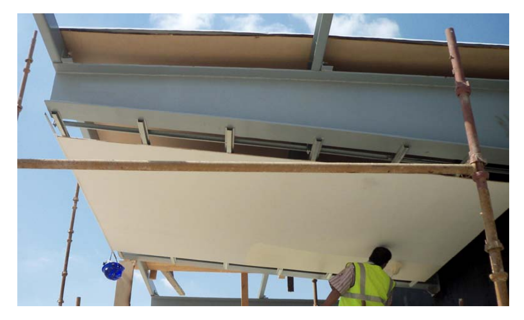
Fig. 5: Using Magnesium oxide boards as Ceiling shaping material