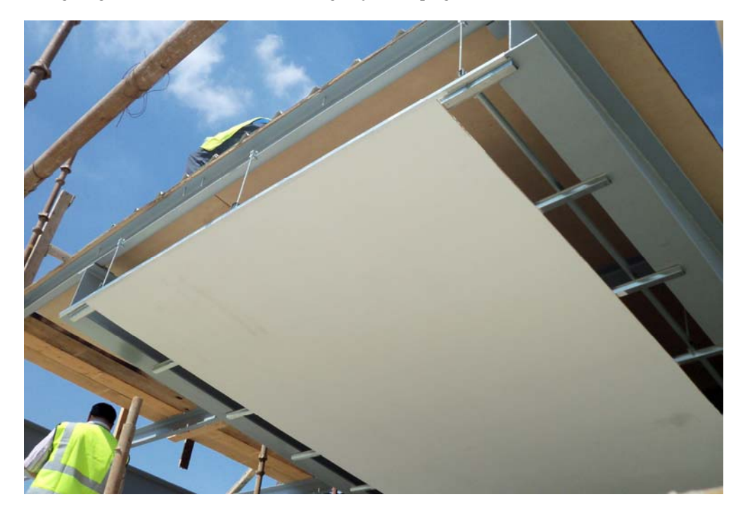
Fig. 4: Using Magnesium oxide boards supporting metal frame.