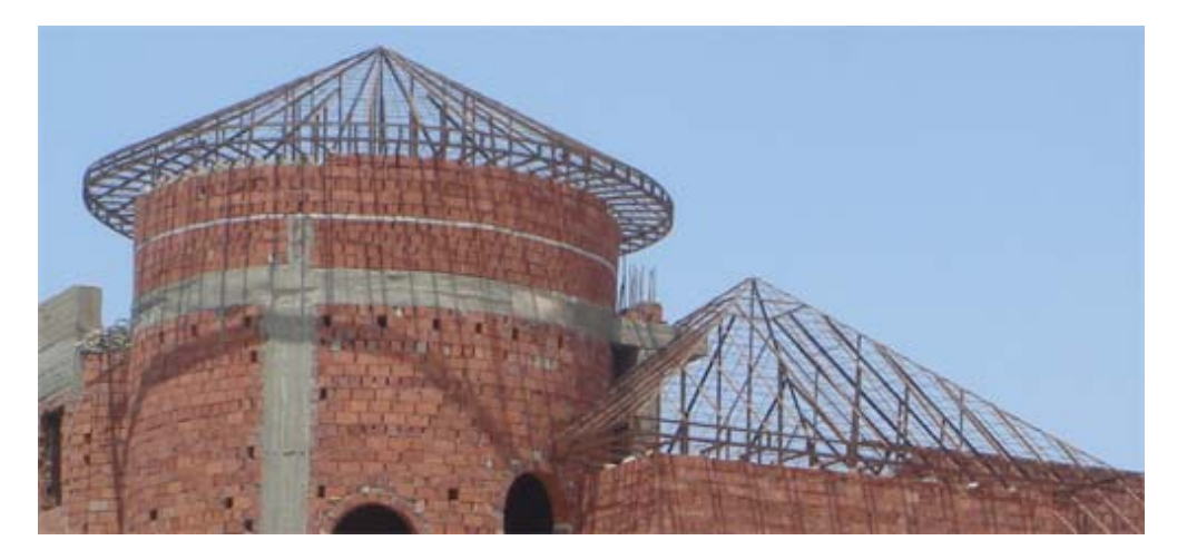
Fig. 2: Steel Frame to support Cement plaster on expanded metal lath.

* A second layer of plaster is applied to the wire mesh, creating an even finish. Scooping plaster up with the trowel and smooth it. This second layer should be approximately 6 Mm thick. Plaster is allowed to dry for 24 hours. The final layer of plaster is left to dry for at least 48 hours before applying any finishing paint or stucco.