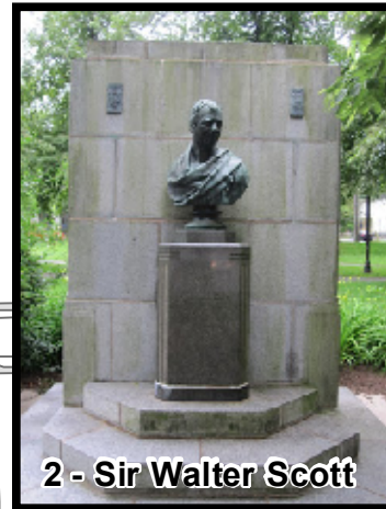
2 - Sir Walter Scott