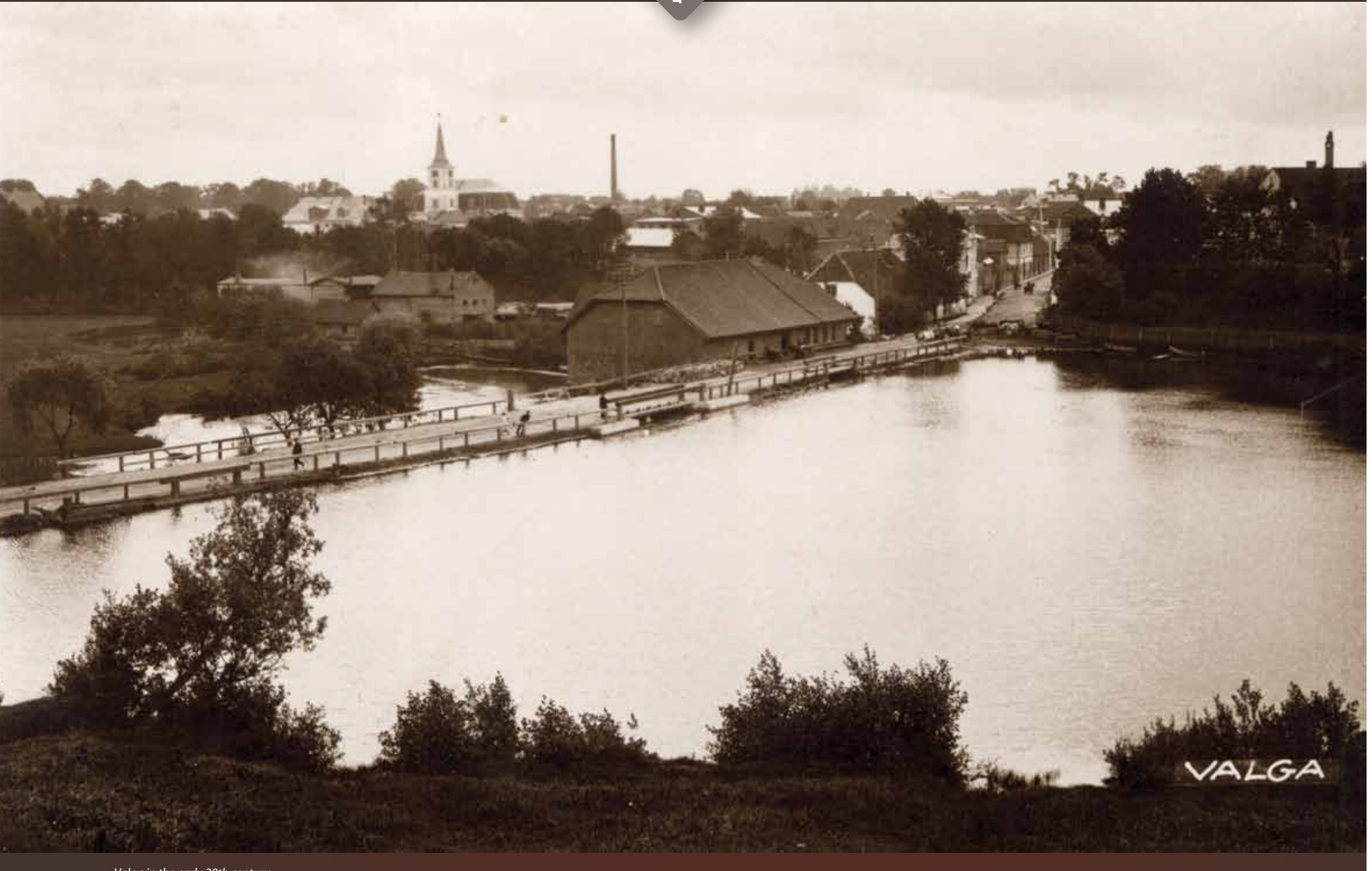
Valga in the early 20th century