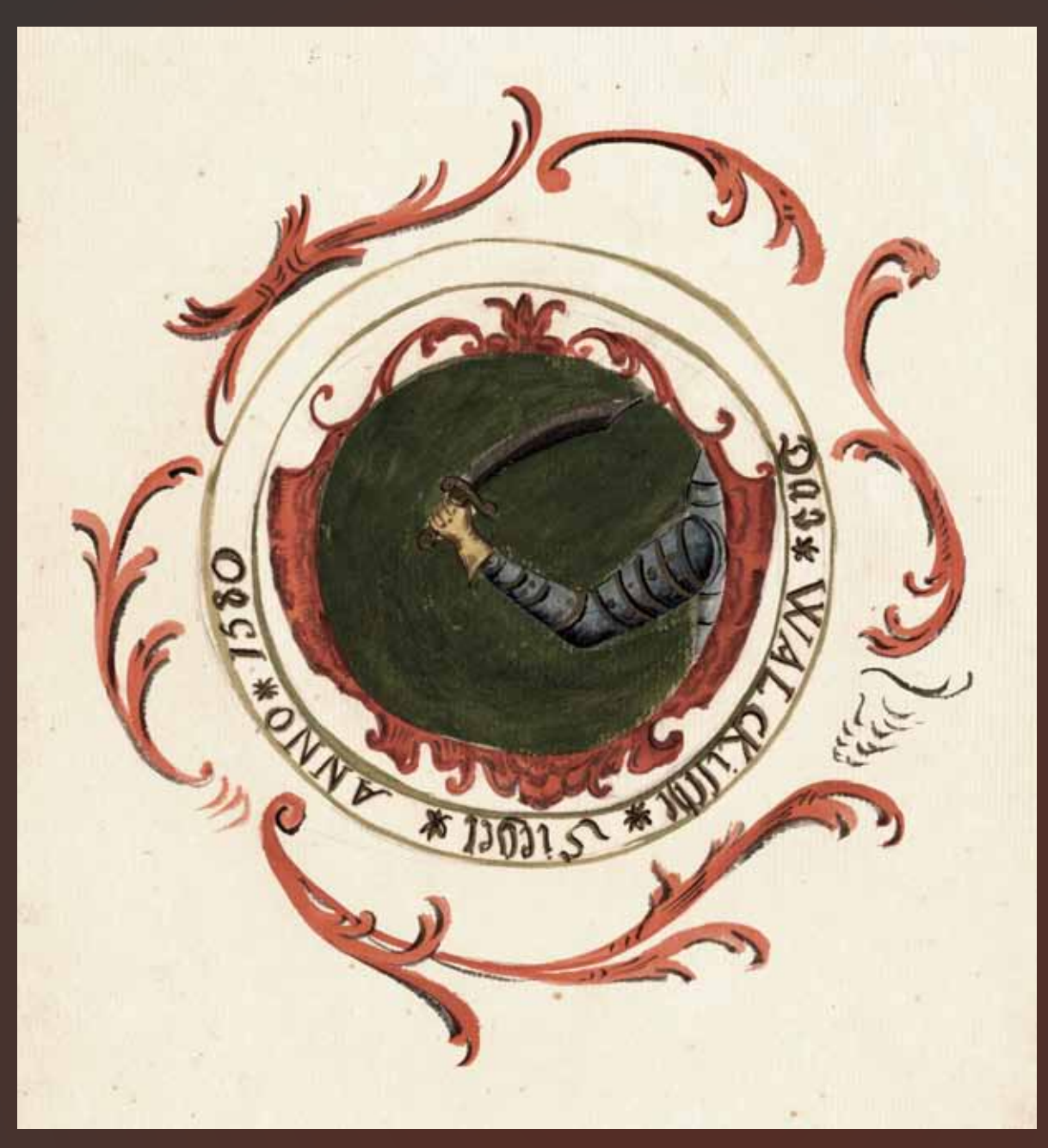
Valga's oldest coat of arms from the 18th century

Having been one city for the majority of its history, in 1584 Valga was granted city status by Stephen Báthory, King of Poland, since South Estonia was part of the Kingdom of Poland from the late 16th century to the early 17th century. In the olden days, noblemen from all over Old Livonia (present-day South Estonia and North Latvia) would assemble there for conferences.