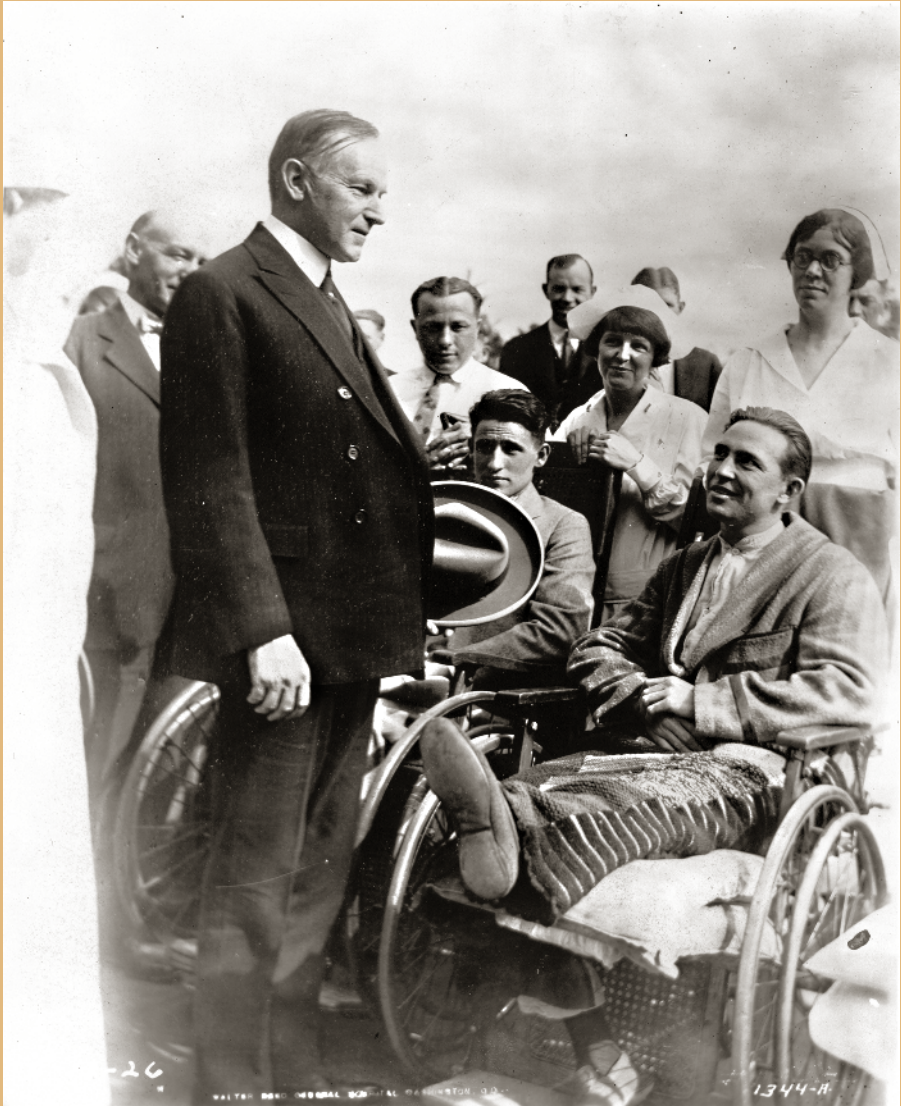
1926, Calvin Coolidge, President of the United States, 1923–1929