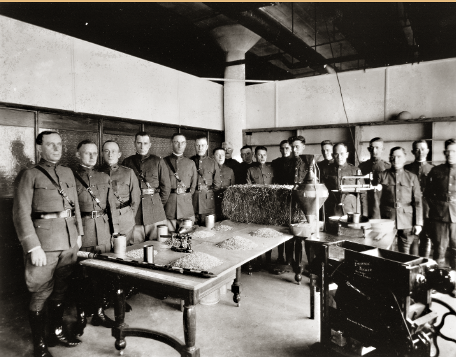
Army Veterinary School, Officers and Enlisted, 1923

Civilian medical education had improved markedly since 1893, and newly commissioned officers were better prepared for general practitioner duties. Public health and epidemiological studies were necessary to the successful maintenance