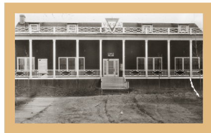
YMCA Hut; site now occupied by permanent barracks.

One of General Ireland’s early policy plans for the general hospital program included the assignment of internes, with pay of $60 a month, ration and quarters, and the status of civilian employees. 21 Implementing the program proved to be slower than anticipated and it was not until 1924, when internes were militarized by appointment as First Lieutenants, that a Director of Training Course For Hospital Internes was added to the Training Section , which had responsibility for such other programs as Hospital Administration , The Army School of Nursing , The Gray Ladies , Anesthesia for Nurses , Laboratory Technique For Nurses , 22 etc. Four internes reported for duty on July 15, 1924, and three additional ones before the close of the year for five months of training on each of the Medical and Surgical Services and a two-month period in the hospital laboratory. After June 1924, the course was under the general supervision of Major Ernest R. Gentry, the Medical Department’s undulant fever expert and Chief of the Medical Service at Walter Reed. The experiment was not only immediately successful, but Colonel Glennan endorsed the annual training of at least fourteen young doctors who would meet the requirements of the National Board of Medical Examiners. 23