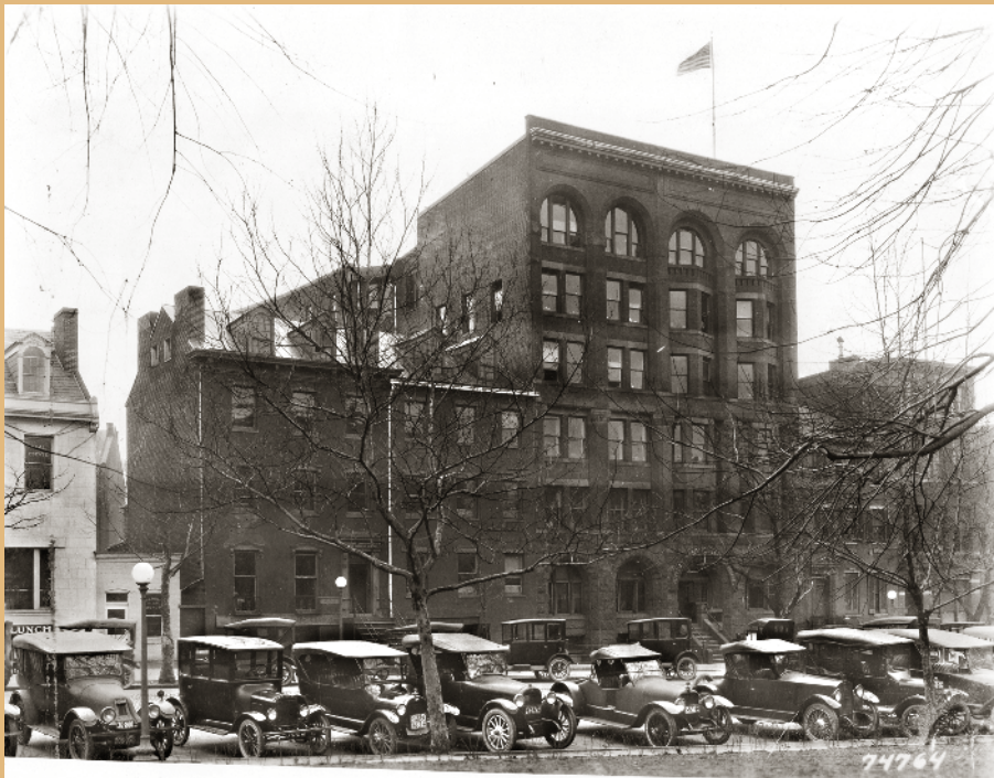
Army Medical School, 1923

The convalescent house was the hub of non-professional activities. There the boys found entertainment and relaxation, card parties and other indoor games,