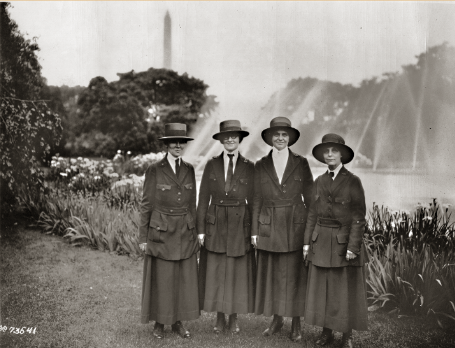
Army Nurses at White House Fete for wounded soldiers, 1922

The comb-like arrangement of the temporary wards was not attractive, but intra-hospital communication and transportation were comparatively easy. The Post Library was strategically located on the “Main Drag,” and its nearest neighbor, arranged T-wise, was Ward 31, where the long-standing chronic cases were treated. The men enjoyed a special sort of community life when on “The Drag,” and a group in wheel chairs could always be found out-of-doors when weather permitted. With the characteristic cheerfulness of the amputee, they would sit for hours refighting their old campaigns, swapping risqué stories or commenting on the appearance, especially feminine, of their unsuspecting public. One double amputee, natural leader of the group, invariably managed to get more than a fair share of the attention, for he was the special pet of the Gray Ladies who wandered about dispensing cheer and charity.