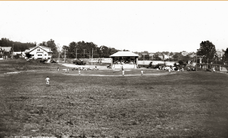
Playing Field; looking toward 14th Street, site now occupied by new Rehabilitation Building, 1924