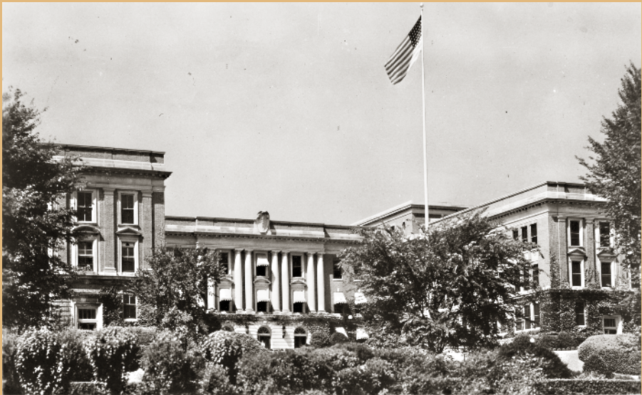
The Army Medical School