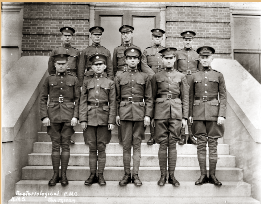
Enlisted Technicians, AMS 1924