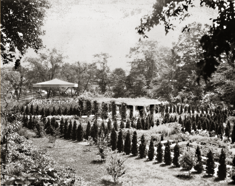
The Formal Garden, Where Cameron's Creek Once Flowed