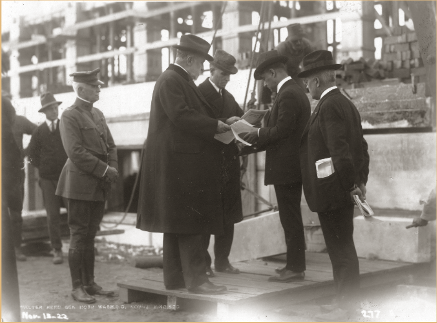
Laying Cornerstone, Army Medical School, General Glennan and Secretary of War Weeks