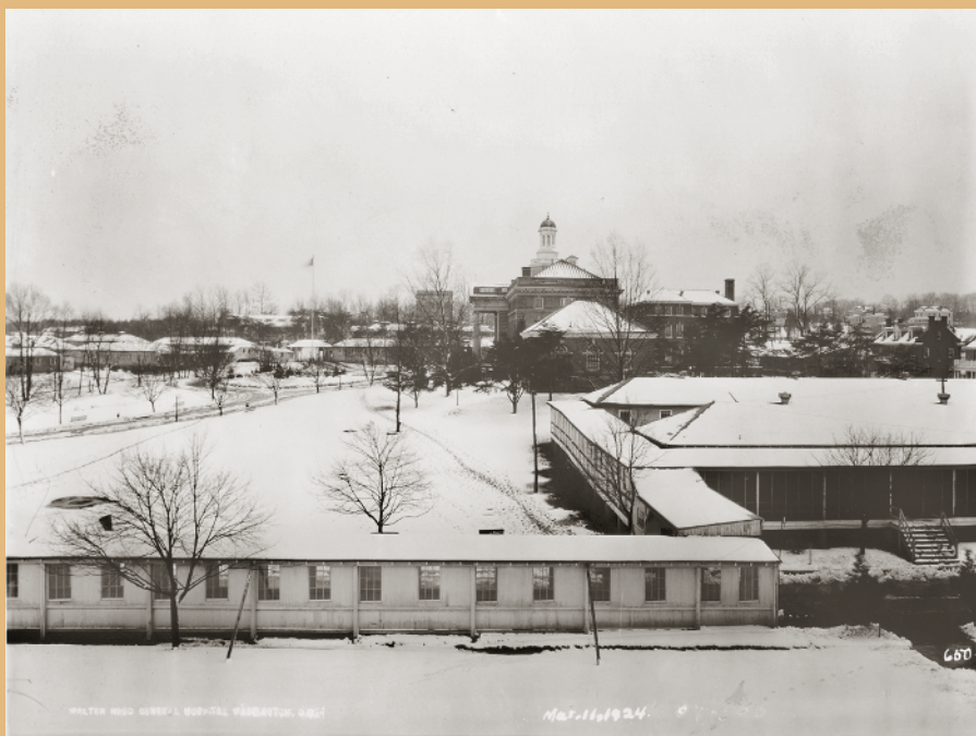
Residue from the War, 1924