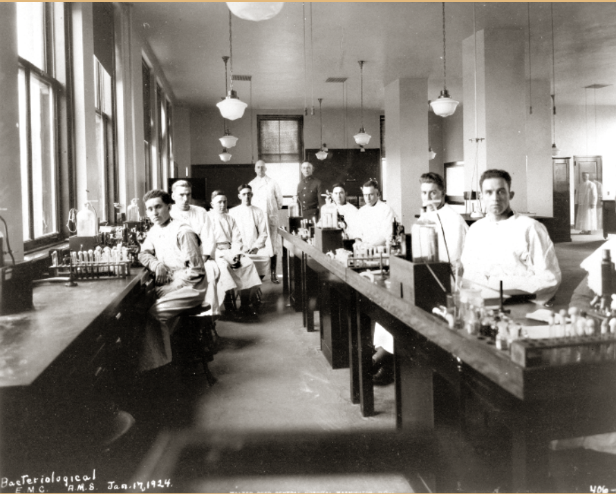
Special Training For Hospital Corpsmen; New AMS Laboratories, 1924