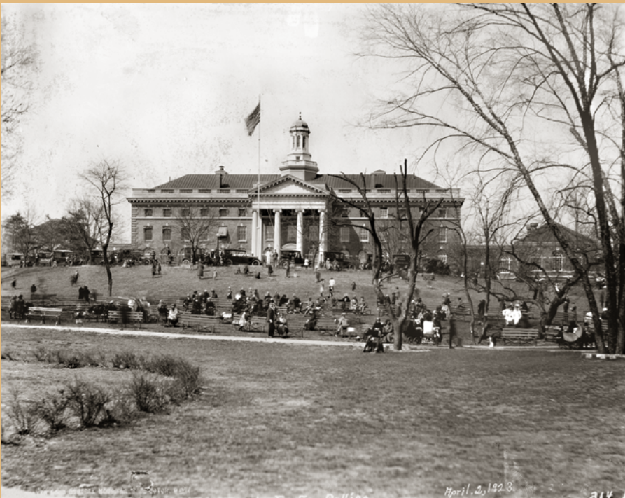
First Easter Egg Rolling, 1923

There was then a freshness and sincerity influencing the management of welfare activities, and at no other time in the hospital's history was the institutional esprit de corps so great as in the early post-World War I years. Morale was a positive and viable factor rather than an artificial by-product of public relations activities. The patients participated wholeheartedly in the parties, carnivals, corn roasts and entertainments sponsored by the Red Cross and Occupational Therapy workers. They attended social functions at the White House with buoyant enthusiasm. Here at last was evidence of democracy, as commoner and king, soldier and commander-in-chief drank the same kind of brew from the same kind of cup. Rehabilitation of the war-wounded proceeded with genuine rather than professional enthusiasm,