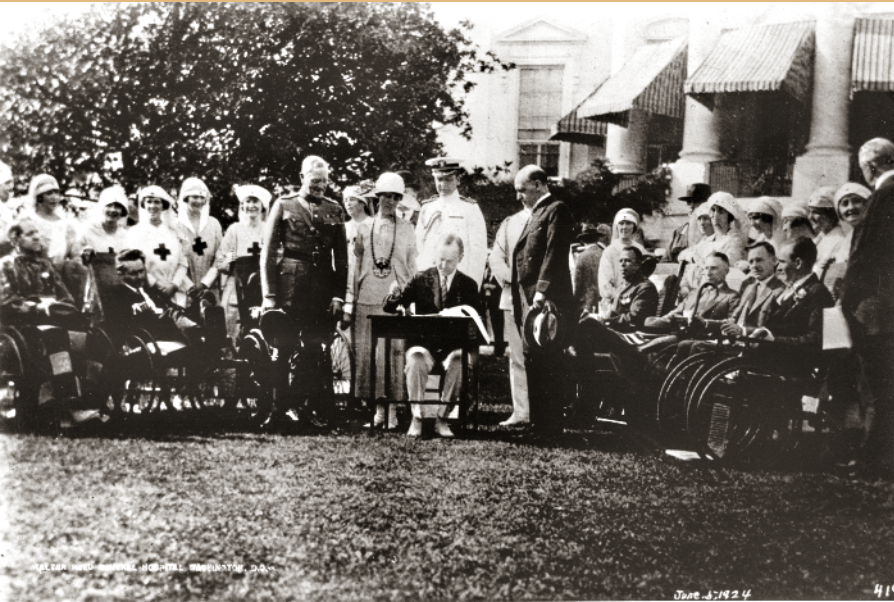
General Pershing watching President Coolidge signing Hospital Bill which extended privilege of Veterans, 1924

In those early and informal days of Post life the majority of the distinguished visitors and sightseers were conducted through the reading room of the hospital library. Others, especially