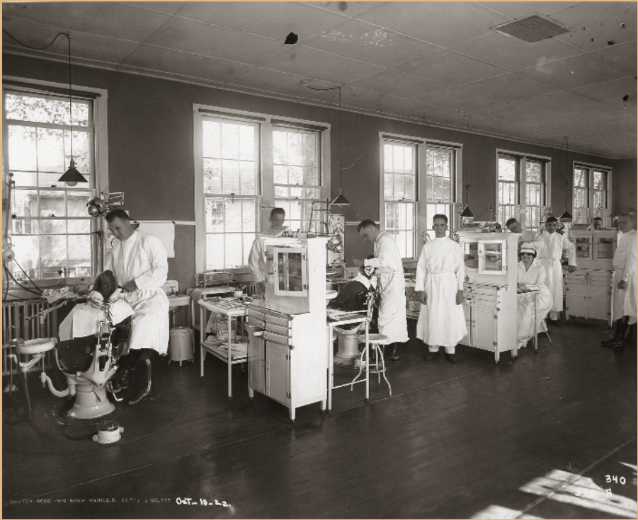
Dental Clinic, WRGH, 1922

Of the 688 orthopedic cases treated in 1923, only fifteen per cent required surgery. On the other hand, some 1,300 cases were seen in consultation from other hospital services or as referrals from the Attending Surgeon's Office, Military District of Washington; and 8,600 plaster of Paris bandages were made in the Orthopedic Appliance Shop, for later use in making body casts. From a strictly statistical evaluation, the EENT section, credited with 1,317 of the total 2,475 operations, Orthopedics, Urology and finally the Obstetrical and Gynecological Sections were the busiest surgical activities.